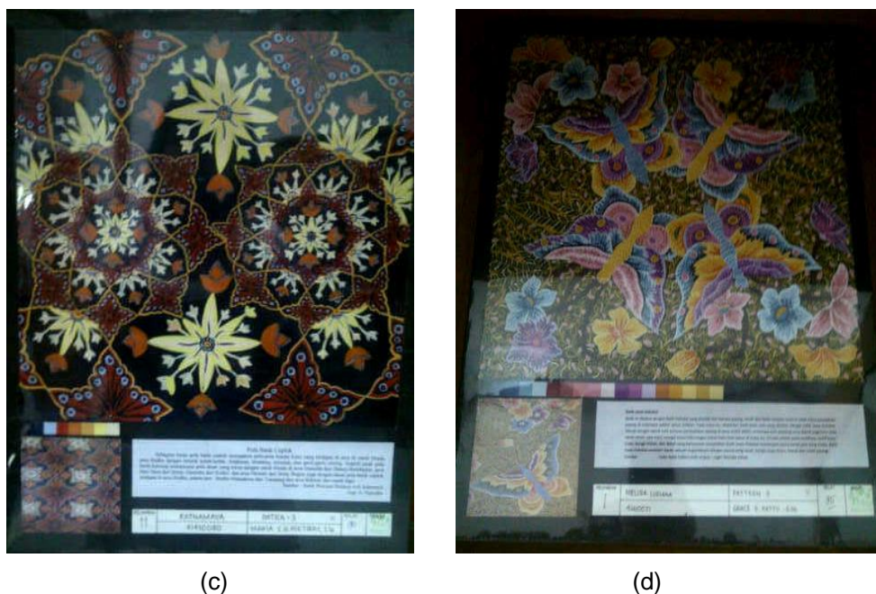
Figure 4. (c) reconstruction of “Batik Ceplok” (d) reconstruction of “Batik Hokokai” designed by Interior Design Petra Christian University Students of 2010