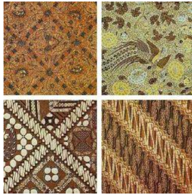
Figure 2. Modern Batik Motifs