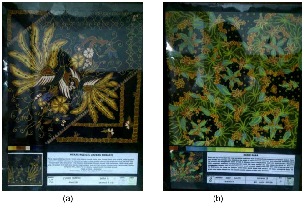
Figure 3. (a) reconstruction of “Batik Merak Ngigel” (b) reconstruction of “Batik Bada” designed by Interior Design Petra Christian University Students of 2010

Here are some of students batik modifications based on previous traditional batik pattern: