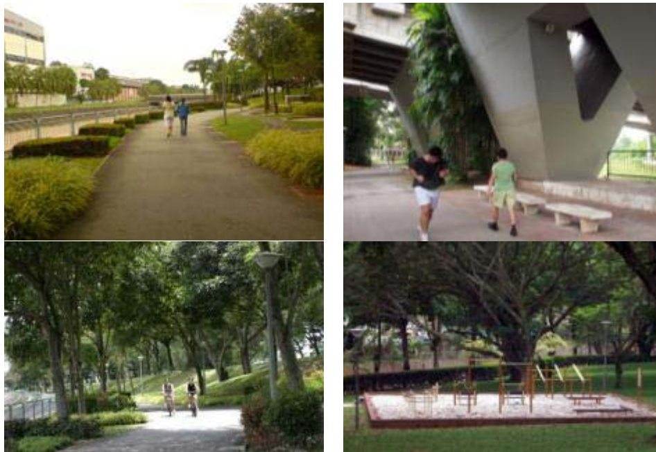
Figure 9 to 12. The UluPandan PC Photos

Based on the author’s personal observation, most users enjoyed cycling and jogging paths because of the good connectivity and the pleasant environment. Further, the greenery living on the river reserve and the adjacent residential and light industrial created a cooling environmental. Also the linear park provided