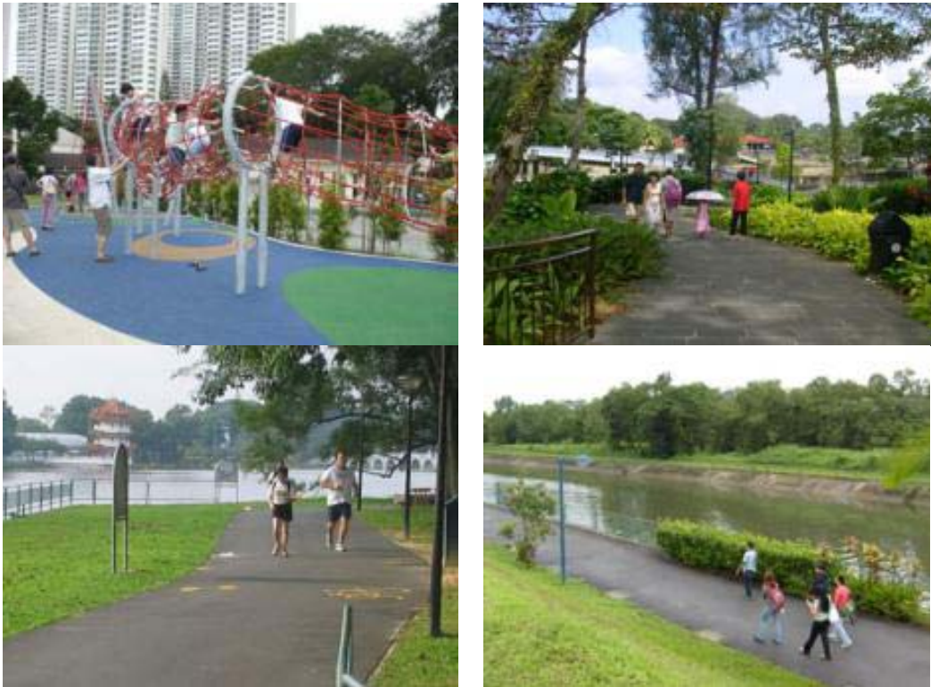
Figure 4 to 7. The Photos of Park Connectors (Upper Left - Alexandra Canal Linear Park, Upper Right - Changi PC, Bottom Left – Jurong PC, Bottom Right – SimpangKiri PC)