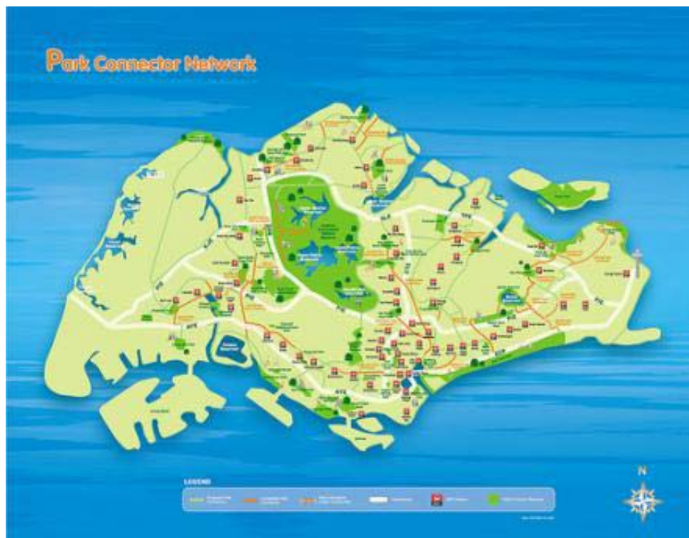
Figure 3. The Park Connector Network finished