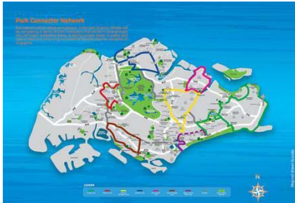
Figure 2. The Park Connector Vision