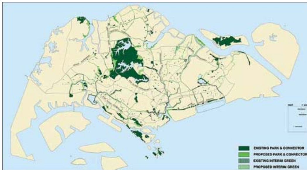
Figure 1. The Green and Blue Plan in Concept Plan 2001

In the context of the Concept Plan of the Garden City, NParks played a major role in creating a city to live work and play in with strategy of growing Singapore's garden infrastructure, cultivating Singapore as premier horticulture hub, and igniting the community passion for greenery. Further, those tasks required commitment and excellence in the field of park planning & research, urban greening & horticulture, management, and nature conservation. 5