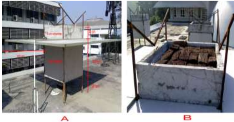
Source: (Mintorogo, 2010) Figure 4: A. The model, B. Covered model with Pakis-stem Blocks