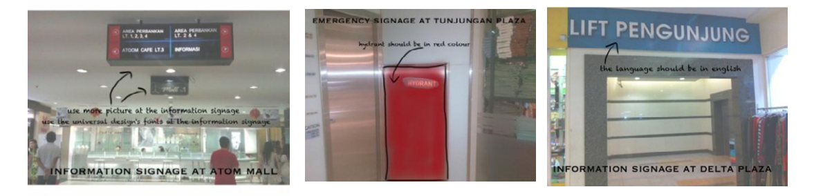
Fig. 2. Sketches of universal design solutions on multiple objects of signage systems do not conform to the criteria of universal design

Here are some examples of design solutions with a sketch directly on the pictures in the signage system that have problems by not optimally applied universal design: