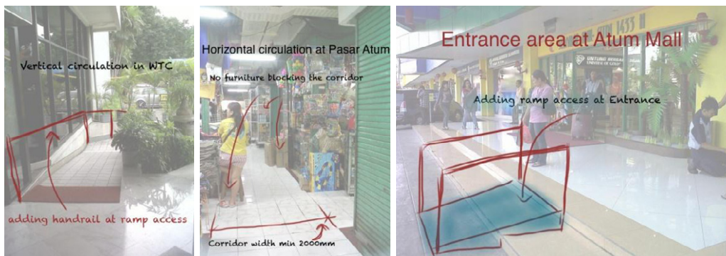
Fig. 2. Sketches of universal design solutions in multiple object instances that do not conform to the criteria of universal design

Here are some examples of design solutions with a sketch directly on the pictures in the entrance and corridor that have problems by not optimally applied universal design: