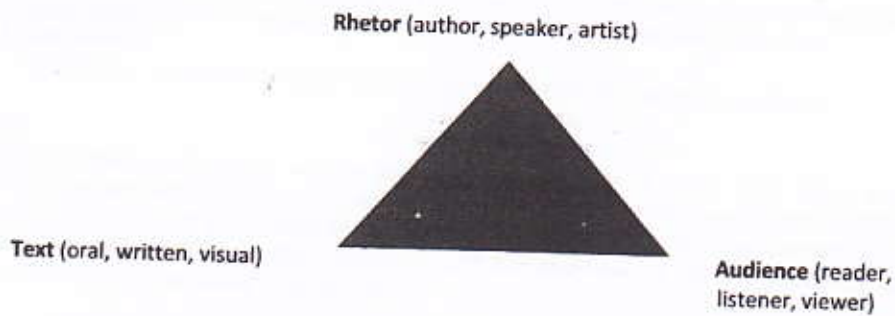
Figure 1 The Rhetorical Triangle (Hesford & Brueggemann, 2007: 2-5)