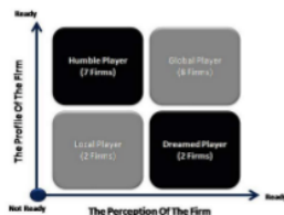
FIGURE 5 THE MAPPING OF PUBLIC ACCOUNTING FIRM

The matrix shows the collaboration thinking of the research result. Researcher identifies there are two dimensions here to look the readiness of local public accounting firms. Those dimensions are "the profile of the firm" and "the perception of the firm". The dimensions can create the mapping of the local public accounting firm position as the following: