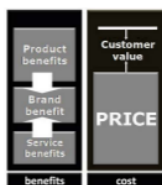
FIGURE 1 BENEFIT VERSUS COST

In the case of a public accounting firm, product benefits offered through audit services, tax, IT-audits or others. Second, service benefit will be obtained after the task was done, such as the client additional questions about the audit results and conclusions. The last benefit is the brand benefits, the benefits obtained through a large 14 auditing firm. There will be differences about the assurance of confidence, whenever the task handled by the Big-Four compared to the Non-Big-Four. These concepts show that the quality of local public accounting firm is important through the value that delivered to the customers. According to the Accounting Office Management and Administration Report (August, 2009), the main reason for clients to stay with the same accounting firm is the quality of the service instead the price factor only. However, Craswell (1992) said that competition and price-cutting could have adverse implications for audit quality (Baskerville, 2006).