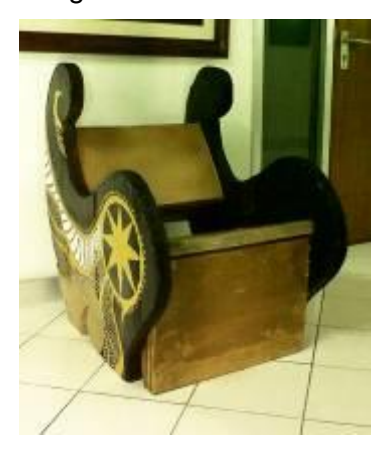
Figure 8. 5 cm Cardboard Layer Thick. Designed by Erlene

construction) and immobile because of its weight. Cardboard furniture has good durability. These chair used as examples are already used for more than 2 years with no significant damage.