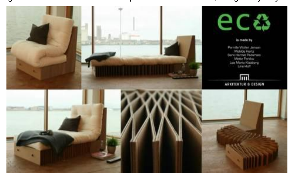
Figure 11. Cardboard Furniture Which May Use Sewing Construction, Designed by: Arkitektur & Design