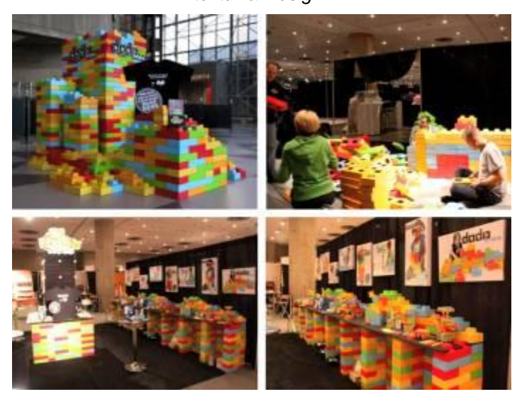
Figure 12. Cardboard Booth in Brick Series Construction, Designed by: Fat Brain Toy Co.