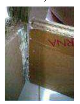
Figure 6. Perpendicular Glued Section

4. For perpendicular fittings, connect each other by gluing each section. But making wood-like construction is possible (like Dowell fitting for example, so the product can be knocked down).