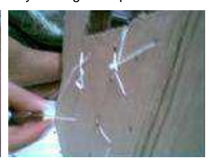
Figure 5. Sew Each Part of Cardboard

4. For perpendicular fittings, connect each other by gluing each section. But making wood-like construction is possible (like Dowell fitting for example, so the product can be knocked down).