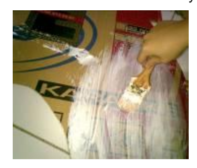
Figure 4. White Glue Layer on Cardboard