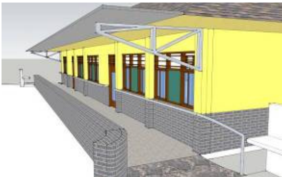
Figure 14. Proposed Additional Roof Canopy.

Because of the rain's impact, the addition of roof canopy was proposed using of polycarbonate. Additional construction was also proposed.