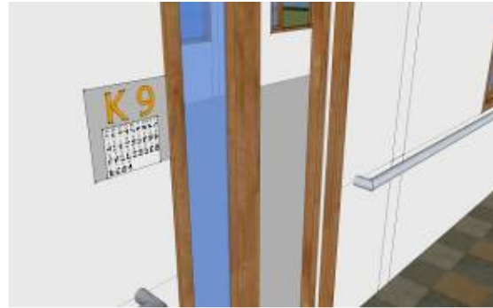
Figure 21. The classroom name signage with a regular letter and braille letter as high as 150 cm in the left of the door.