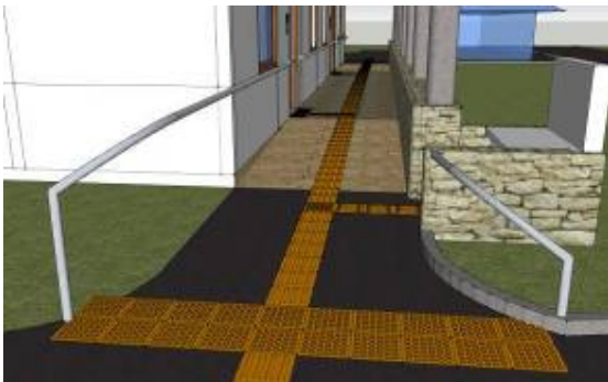
Figure 19. Proposed Railing