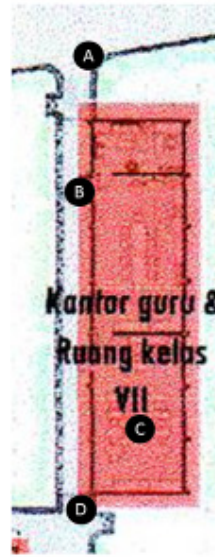
Figure 5. Focus Areas that were evaluated in workshop in the SMPLB - A YPAB

User's spectrum SMPLB - A YPAB comprised of Non-diffable Teacher, Total Blind Teacher, Low Vision Teacher, Total Blind Students, Low-Vision Blind Students and Non-diffable Employee.