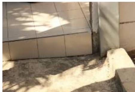
Figure 11. The harmful stair in the pathway end.