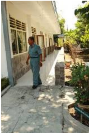
Figure 6. The corridor was quite wide and designed with ramp.