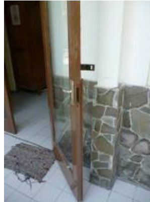
Figure .8. Dangerous door because it opened out to the pathway, causing many accidents to the blind students. And the sharp end of columns also that could harm Students.

Unfortunately, the Fifth Principle, Tolerance for Error, was not achieved in Point B. It was caused by the great number of accidents on the Students because of the door opening out and not folded. Besides that, the sharp end of the door endangered the students. Because of that, it was proposed to use the sliding doors, while keeping the glass doors to help low vision students.