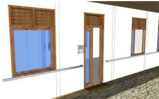
Figure 15. Proposed Ideal Window Design and Door for Blind School.

wider (120cm) to facilitate cross ventilation. While the proposed sliding doors as well as wide as 90cm (85cm width clearance is needed to facilitate wheelchair entrance).