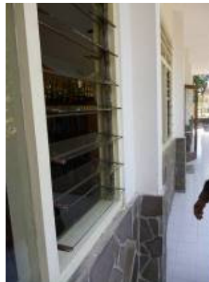
Figure 9. Sharp jalousie window.

The sharp end of the jalousie window also endangered Students. Because of that, the windows were proposed to be converted to sliding windows. Then, railing was also proposed to ensure the Students safety.