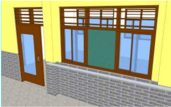
Figure 12. Proposed Sliding Window and Sliding Door.

A Ramp proposed as a solution to the building height difference problems between building and pathway. On the ramp, it was proposed to use non-slippery materials for safer use of people with visual impairment. Meanwhile, railing was also proposed from Point A to Point D. It was proposed to be a safety and guidance.