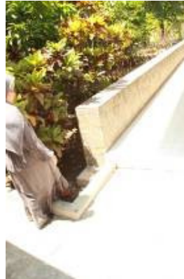
Figure 10. The Pit on the edge of the pathway.

The Sixth Principle, Low Physical Effort, also less fulfilled in Point D because the difficult to pass through by the new students. Finally, the Seventh Principle, Size and Space for Approach and Use, had been met because of size and space corridor was wide enough.