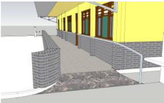
Figure 13. Proposed Ramp and Railing.

A Ramp proposed as a solution to the building height difference problems between building and pathway. On the ramp, it was proposed to use non-slippery materials for safer use of people with visual impairment. Meanwhile, railing was also proposed from Point A to Point D. It was proposed to be a safety and guidance.