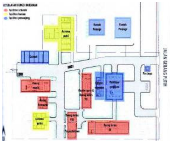
Figure 4. Plan SMPLB - A YPAB on Jl Gebang White No. 5, Surabaya

Special Junior High School Type - A, Education Foundation for Blind Children (SMPLB - A YPAB) is a proper place to discuss the condition of ease of movement / activities in the city of Surabaya. SMPLB A YPAB domiciled in Jl Gebang Putih No. 5 is provided for the school education of the blind. In SMPLB - A YPAB, there were 27 students enrolled in school, consisting of 11 female students and 16 male students.