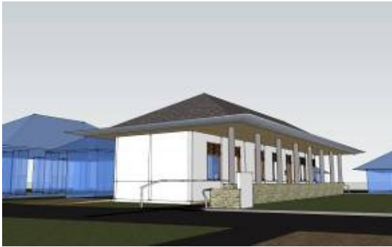
Figure 17. The Proposed Roof Design which is wider than the pathway.