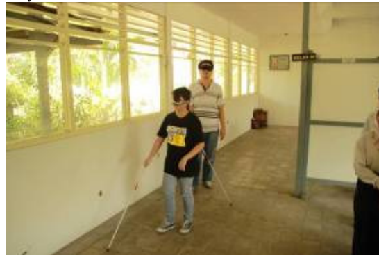
Figure 1. Students' simulation as blind persons in SMPLB YPAB

Reflection of the Petra's students, who followed this process, the route to the classes in SMPLB-A YPAB were very difficult. It was because no clear markers and many dangerous designs. Additionally, when being blindful, they felt low self-confidence and fear.