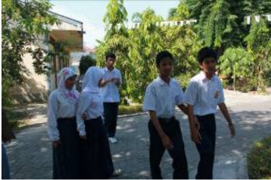
Figure 2. Students of SMPLB - A YPAB who accompanied the Undergraduate Students in the simulation. The Junior High School Students guided and explained the clues to help orientation. From the simulation, several locations in the School were not accessible.

In the subsequent meetings conducted three focus group discussions between undergraduate students and teachers in SMPLB-A YPAB to find problems-problems in the design of the corridor in front of the principal's office, staff room and classrooms. This space was analysed as strategic because it was the centre of activity and may represent other parts of the School. To facilitate the discussion, the 1:20 - scale mock-up was made to facilitate the discussion.