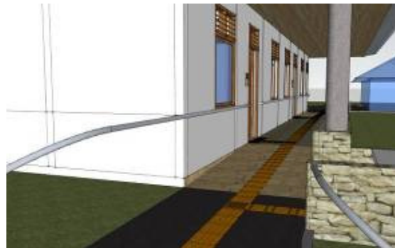
Figure 16. Proposed Design Ideal Ramp

Meanwhile, the non-slippery floor material is proposed on the ramp. One example of the material is Granito product. ( Http://granito.co.id/ )[7]