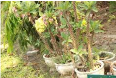
Figure 7. Thorny plants on the side of the pathways.

The Sixth Principle, Low Physical Effort, was achieved in point A, because of a ramp was provided to facilitate movement. Finally, the Seventh Principle, Size and Space for Approach and Use, was also achieved due to the width of the corridor is wide enough (150cm). It can be concluded that the point A point was quite accessible but still less secure.