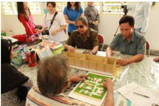
Figure 3. Participatory Design with blind teachers in SMPLB-AYPAB

Additionally, mock-up for Orientation and Mobility in the school environment was for the Junior High School Students. And 1:200 scale mock-up was recommended.