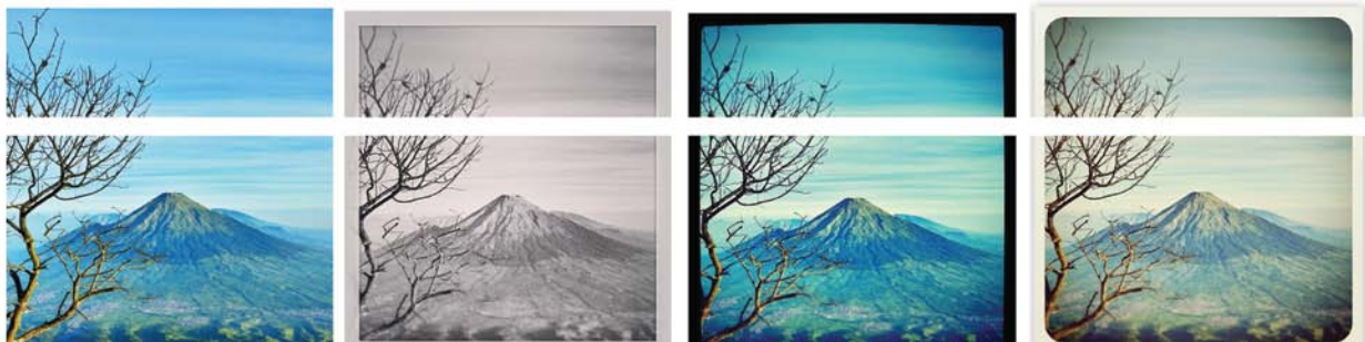
Figure 2. (left-right) questionnaire stimulus: photo of a mountain without filters, modification 1 with Willow, modification 2 with XproII and modification 3 with Earlybird

Quantitatively set of data has been solicited by questionnaire likert scale over 46 respondents of 23 serious amateurs and of 23 amateurs with stimulus above, a photo of mountain has been chosen due to the filter as the focus in this research instead of the object as the main study, and prior to this from survey over 20 Instagram users, a photo of mountain was considered to be the most valuable when compared to other landscape object photos such as beach, sky, urban, forest, and sunset, on the other hand mountains are always neutral and objective, since they can be perceived and interpreted universally.