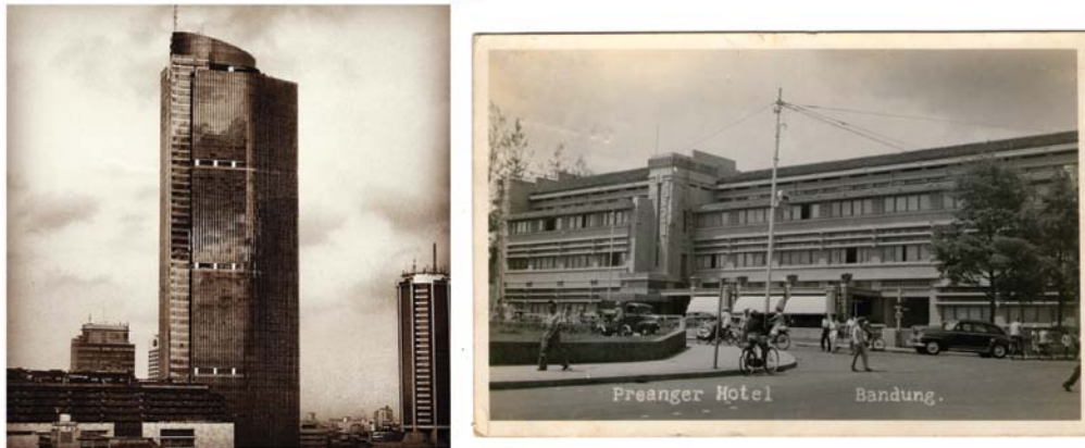
Figure 1 (left-right) the faux vintage photo of modern buildings and the genuine old photo of Preanger Hotel around 1950s.

black and white films, the combination of them produced unique-idiosyncratic photos, yet they had a particular feature that still be recognized as vintage, such as aquatic or yellowish color, black and white, vignette, blur, washed out color, grain, frame etc. Below are the example of black and white vintage photo (right) and the grainy faux one (left) with digital modification in higher level of contrast, additional vignette and the color also has been changed to brownish black and white which brings out the vintage features that familiar to the viewer's eye all harmonized to visualize the experience of old time feeling.