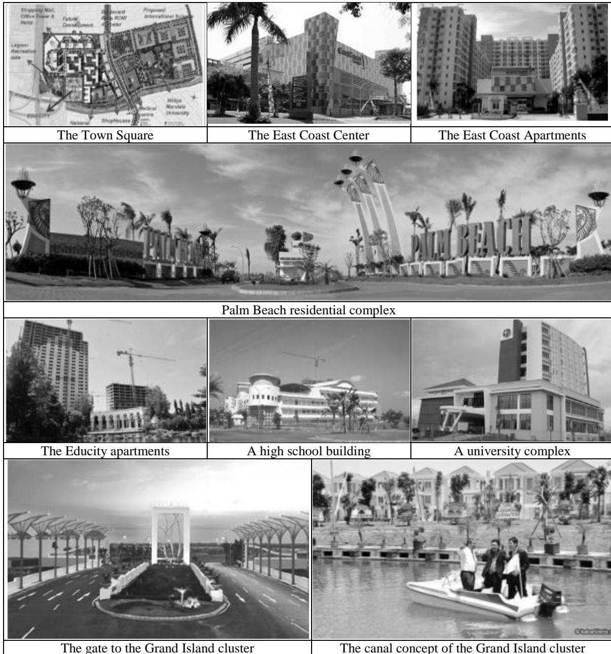
Figure 4. The livable residential areas with public facilities at the Pakuwon City.

percent per year. 3 This current land price is not only influenced by the open space, but also the provision of amenities in the residential complex, however as shown in the price list of lots, a certain lot close to a park is valued 10 to 20 percent higher than those far from the parks. One popular park with retention pond is Taman Angsa or Goose Park (Figure 3). In 2014, a new residential area has been developed related to the 'open space as added value' such as the Grand Island cluster is developed as a canal resort, a residential complex with water recreation and sports, and the land price of a lot is 21,500,000 per m2 (Figure 4). 4