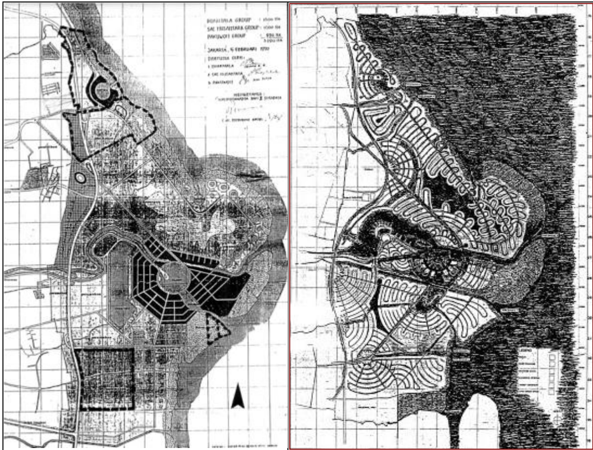
Figure 2. The conceptual Master Plan of the East Coast of Surabaya designed by Paul M. Rudolph (1918-1997) in 1990 (left), and the final Master Plan designed in 1991 (right).