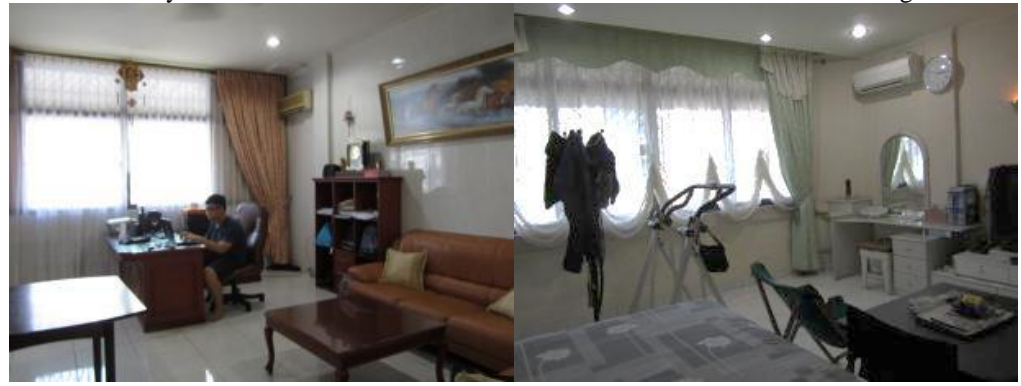
Figure 6. Windows as access elements of natural light

building. Their type, dimensions and positions determine the quality of wind flow circulating in the building (Lechner:2007, Mediastika:2002, Kindangen:2005). Majority of the shop houses use artificial ventilation system, while using windows for the circulation of natural ventilation. In the shop house having artificial ventilation system, the window only functions as access elements for natural light and cross ventilation.