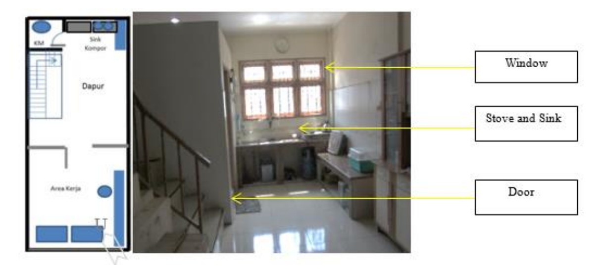
Figure,7 Layout plan of the Second Floor of the Shop house and the position of back windows

In some of the shop houses, natural ventilation is only used in parts of the back room layer, particularly the kitchen. In this condition, the back windows function as inlet and outlet at the same time and become the access point of entrance and exit of air flow. This position is considered less favorable because with the inlet and outlet parallel to each other, the air flow would be confined only the back areas of the building.