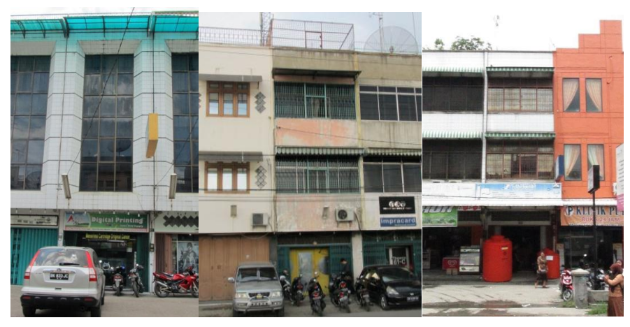
Figure 5. The form of doors and windows on the main façade of the shop houses

Besides the doors, windows are also access points that ought to be considered after doors according to Fengshui rules as they influence the passage of positive energy in the building. In good land locations, Fengshui sets openings as wide as possible to maximize wind flow or qi into the building. According to the concept of passive ventilation of buildings, the character of the windows truly influences air flow in the