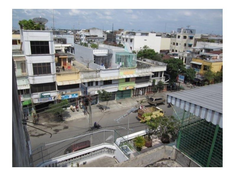
Figure 4. The density of buildings in Jalan Sutomo Ujung Medan

From the analysis of the building position on the right and left of the shop house, its position between one another forms a density of buildings that creates a corridor and directs the wind flow. The dominant condition of the shop house in Medan has a potential of directing the wind to move along the corridor of the shops.