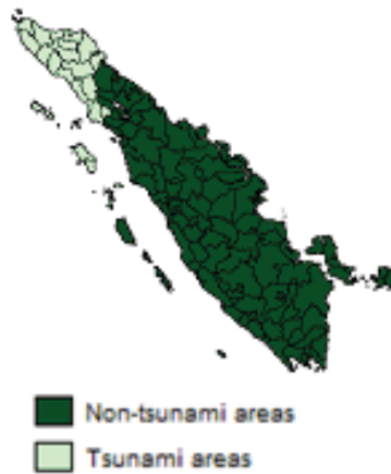
Figure A. The map of Sumatra Island