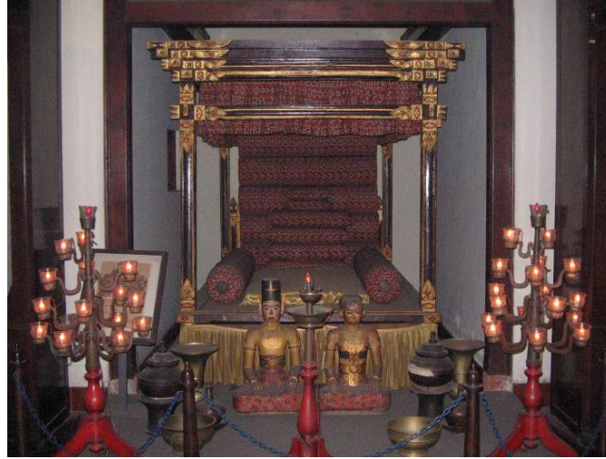
Figure 5. Replication of Krobongan in senthong tengah and its pasren equipments in Yogyakarta