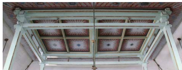
Figure 3. Intercropping ceiling in Pendhapa Dalem Mangkunegaran Surakarta

The interior space of a building is formed by structural elements of the architecture. Columns, walls, floors, ceilings, doors and windows give shape to the building, separating it from the outside, and form a pattern arrangement of interior spaces. In the context of Javanese house construction, residents will meet with other people in an open space in front. The boundaries of the open space that blocks visual and physical interaction is minimized in order to allow intensive relations with the outside world. The pendhapa is bounded only by elevated floor terraces, lines of columns and its teritis shade. The floors used, as physical elements of the interior space, are usually of the same material in the pendhapa , dalem and the other areas. Whereas the ceiling shading the interior space and providing physical and psychological protection usually use the intercropping roof arrangement but sometimes could also be in the form of a flat plane covering the roof.