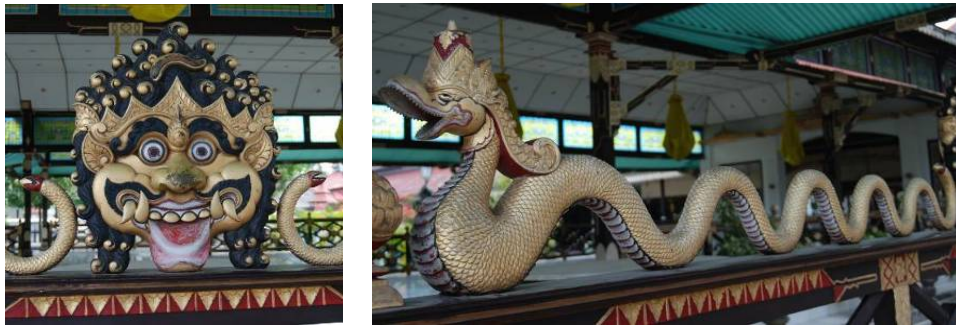
Figure 7. Decorative Ornaments on the gates of Bangsal Manis Keraton Yogyakarta, in the form of kemamang flanked by two dragon snakes (Photo: Author Documentation).

decoration is a form of natural representation of heaven to earth. Decorations that represents heaven to the Javanese people are ornaments found in Hindu temples. In this temple we can find ornaments of flora or fauna found that have been distilled. Following the arrival of Islamic art and culture, represented by the mosque buildings, ornaments of calligraphy are widely used. Ornaments of flora that are well-known in Yogyakarta, among others, are lung-lungan , saton , wajikan , nanasan , tlacapan , kebenan , Patran , padma , and so forth. Fauna decorations, among others are kemamang , rooster, dragon, and peksi garuda . Decorations referring to religious aspects and beliefs among others are mirong and calligraphy. Natural ornaments include mountains, makutha , Praba , kepetan , and so forth. Each ornament has a shape, color and symbolic meaning. They are all usually stylized from their original forms. (Dakung, 1981/1982).