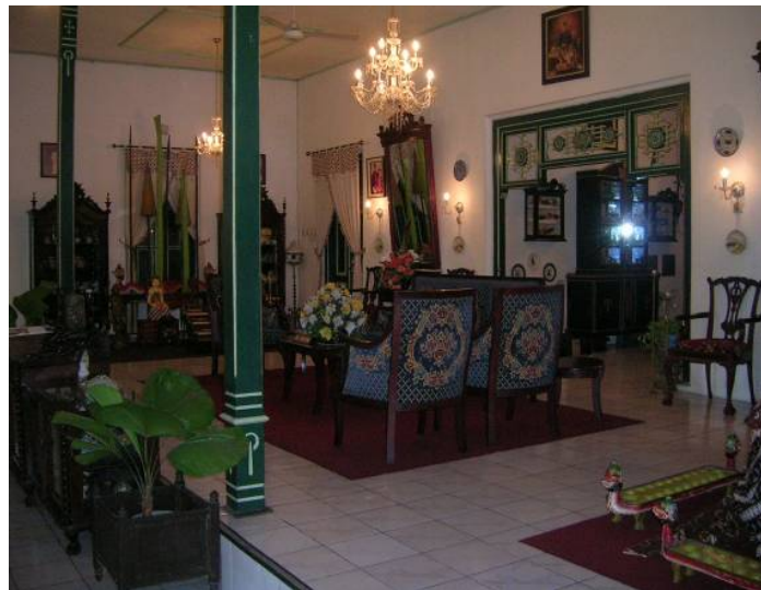
Figure 6. Dalem center serves as a living room and showroom for valuable objects in dalem GBPH. Joyokusumo