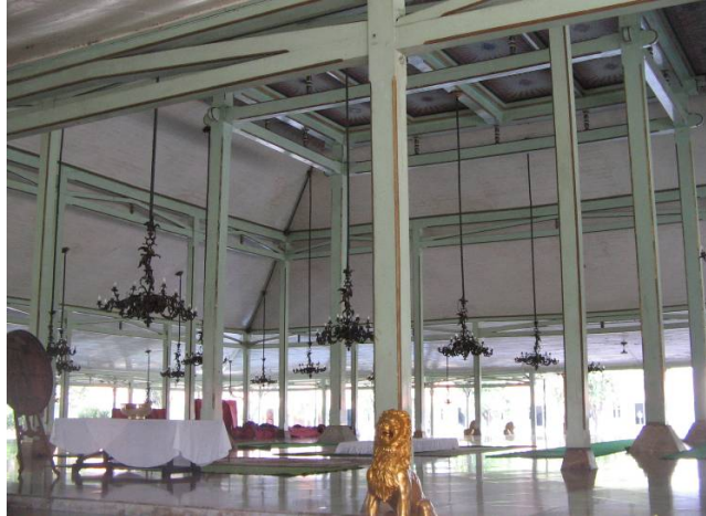
Figure 4. The Interior of Pendhapa Dalem Mangkunegaran Surakarta

High columns with an intercrossing crown in the middle of the pendhapa of the Javanese house are vertical figures that defines center of the room. The binding centre is expressed by the building and actions its occupants. The actions that define this center may also mean to express the authority of the owner as the leading force in the realm of his control. Whereas the protected realm or the back area of the house, is part of the nature of the private space that maximizes the physical boundaries of the room. To create the character of space as a part that is protected is to elevate, thicken and arrange multiple layers of binding walls, as well as to reduce openings or the penetration of sunlight. Functionally, this means restricting access. The nature of this area is more towards protective rather than just private (Santosa: 2000).