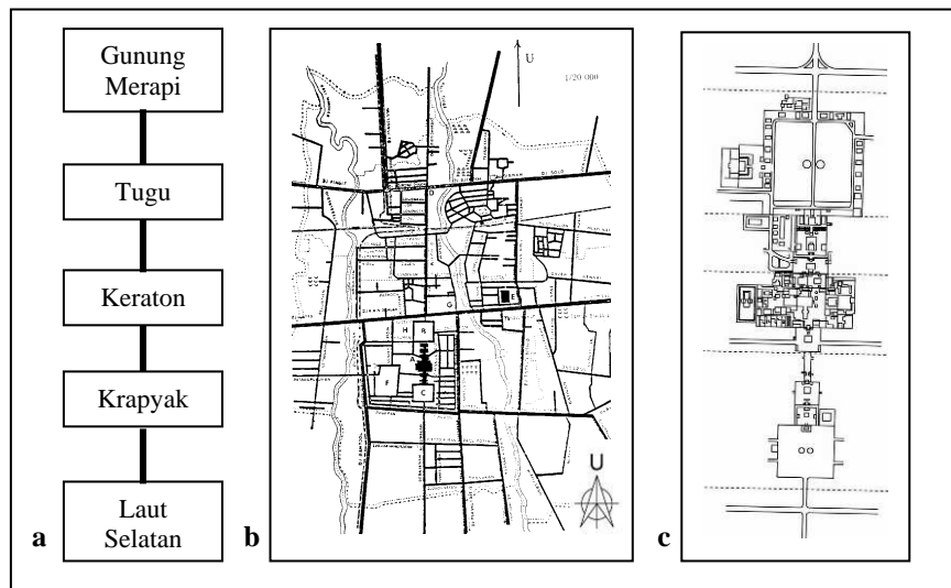
Figure 1. (a) Imaginer line Keraton Yogyakarta; (b) The map of Yogyakarta city (Lombart, 2000); (c) The lay out of Keraton Yogyakarta (Gunawan, 1993).

universe which varies but united and fulfils each other because of their blending, leading to the paradox condition, to get safety and blessing. The classification covering four-dimension space, using four-wind direction pattern with keraton as the center, shows the opposing basic unity to reach the goal to the orderliness of the world as expected. If we draw the cross line on east-west and south-north, we will find center point called pusering jagad . In Javanese science, four directions with one center is known as sedulur papat-lima pancer or kiblat papat-lima pancer . With the center as paradox it shows space and time that give blessing for human. Society that is guided with the four-one concept will experience peace, became determined and will not disturbed by any changes.