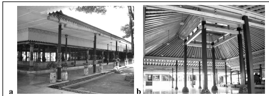
Figure 4. (a) Bangsal Kencana, oriented primary marker; (b) Dalem Kesatriyan in the east of Prabayeksa.