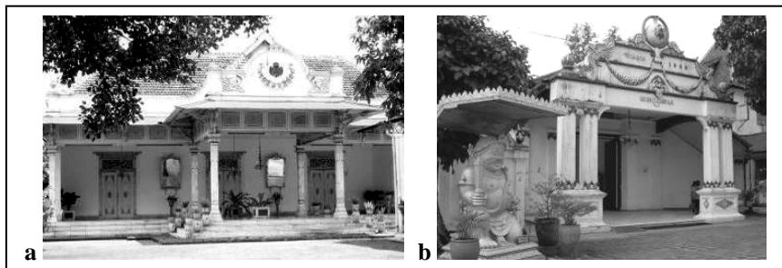
Figure 3. (a) Gedhong Kuning building; (b) Regol Danapertapa to Kedhaton

Prabayeksa was built in 1694, marked by candrasengkalamemet Warna Sanga Rasa Tunggal . Prabayeksa is the center of power and can be interpreted as giant light or great light ( probo = light, yekso = giant). In Prabayeksa there is eternal flame or Kyai Wiji as the symbol of single eternity. The everlasting flame symbolizes the imperishable seed because of God, life journey guided by the great light, so bright till it comes to an eternal spot. Inside Prabayeksa there is a decorated bed called krobongan facing 4 directions, leading to kiblat papat lima pancer , that means wherever human is going, he is facing God. Prabayeksa pair in the east is Bangsal Kencono. This bangsal is used for receiving sungkeman and ngabekten abdi dalem on special occasions such as Idul Fitri. The establishment of Bangsal Kencono was marked by candrasengkalamemet Trus Satunggal Panditaning Ratu , which means it was built in 1719. Sultan Hamengku Buwono IX was rested in this hall when he died on October 7, 1988. In jumenengan session of Sultan Hamengku Buwana X, this bangsal was used to receive ngabekten from relatives and abdi dalem of keraton. Bangsal Kencana is a golden hall symbolizing manunggaling kawulo-Gusti , symbol of the blend of king and his people (Harnoko, 2001).