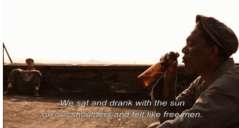
Screenshot 2. Andy's agency created a different atmosphere

The second example of Andy's agency was when Andy asked for some fund to add the book collections of prison library from Warden Norton. Of course, changing the structure in the prison regarding the library could be said to be impossible. Based on Brooks' experience (the inmate librarian) who had been imprisoned for more than 50 years and who had experienced six times of warden change, the request for fund to add the library book collections was never granted (Screenshot 3). However, with Andy's resource of financial and tax knowledge, which finally made Warden Norton also ask Andy for financial advice, Andy was allowed to write a letter to the Senate once every week (Screenshot 4). After 6 years of sending letters without break, Andy's request was granted. From the three-layered structure, it can be seen that Andy employs the resource of his relationship (facility) with the warden to get a permission to write letters to the Senate (domination) and the modality he applies to communicate is an interpretive scheme of "education" which finally gives power to him to get what he wants.