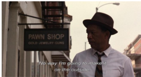
Screenshot 5. Prison structure's grip on Red after 40 years of being institutionalized

could ever die. Finally, Red made the choice to go and meet Andy, otherwise he would have ended up in prison all his life. In the room where Brooks carved on the wall "Brooks was here", before committing suicide, Red also carved a similar sentence next to it "so was Red", making a different choice to keep up living outside prison although the conclusion was unclear to him at that point (Screenshot 6).