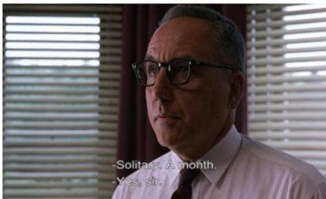
Screenshot 8. Norton made use of the prison structure as a warden with legitimate power to determine people's life and behavior

story told by Tommy Williams, Warden Norton insisted on not finding the truth because of the two reasons mentioned earlier. When Andy persevered to get justice and pushed Norton by mentioning something about laundering the tax money, he was put in a solitary cell for a month (Screenshot 8). This cell effectively made someone suffer a lot so that Andy later on even admitted that he was guilty and quitted his idea of getting justice in line with the structure or system since he schemed his own way to find one. This example shows how the structure of the prison which gives a big power to the warden changes Andy's behavior and belief in his helplessness. It can be said that this example shows the interplaying working of prison structure and Norton's agency. Norton will not be able to exercise his agency if he is not taking the position of a warden in the prison structure.