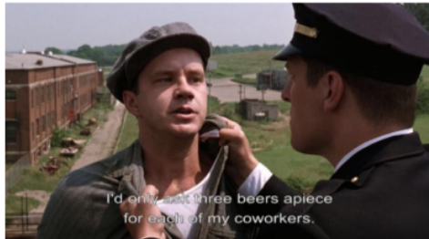
Screenshot 1. Andy's agency and the risk of being pushed off the roof

inmates was changed too. Since that day Andy's inmates respected and supported Andy, even the prison guards protected him from being bullied by Bogs (a fierce inmate) and his gangs. This example shows that even though Andy's agency can make a change on the relation of the inmates with the guards and among the inmates, it still needs the approval of Captain Hadley to accept Andy's offer and to grant his request. This shows an interlocking relation between agency and structure.