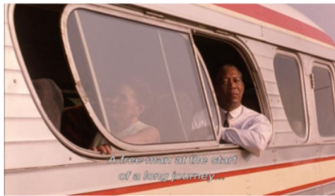
Screenshot 6. An inmate broke loose of prison structure's grip to start living a new life

The next example of Andy's agency can be seen after Andy got donations of books and some gramophone records and he played a record in the prison guard's office. Music in Shawshank prison was never heard, and Andy played the record and put it on the prison loudspeaker. It gave a stunning effect to all inmates as if it were a miracle for them (Screenshot 7), and it drove all the guards and Warden Norton furious. In this example, Andy's agency undermined the prison structure by doing something that was never done before in it. Furthermore, Andy played the record without asking permission from the guard or Warden Norton (who had power to determine what was accepted or what was not). Indeed, Andy's agency could make a change in prison, but it was only for a while. Nevertheless, it was not only a fancy change of habit in prison, but it gave such a profound impact to the inmates that Red made the following statement, "And for the briefest of moments, every last man at Shawshank felt free." However, Andy's action resulted in his being put in the hole (a stifling cell to give a punishment to disobedient inmates) for two