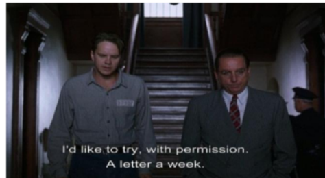
Screenshot 4. Strong structure and agent's negotiation with Warden Norton

As Warden Norton himself said there were only three ways to spend the taxpayers' money for prison, namely for more walls, more bars, and more guards, which meant that a request for more books was sheer impossible. However, through his agency, Andy tried to negotiate with the Warden to get a permission to write letters. Actually, Warden Norton gave Andy a permission to write letters only to make him happy, but finally Andy's request was granted. This example shows that Andy's agency can change a part of the prison structure regarding the library although he needs to negotiate with the warden (representing the structure) to get the permission to write the letters. Thus, it shows that there is an interplay of Andy's agency and the prison structure.