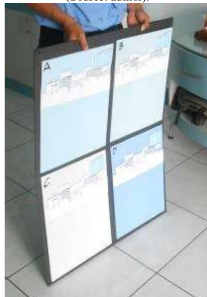
Figure 2. Colour panel with Nippon Paint to help the visualisation of the patients.