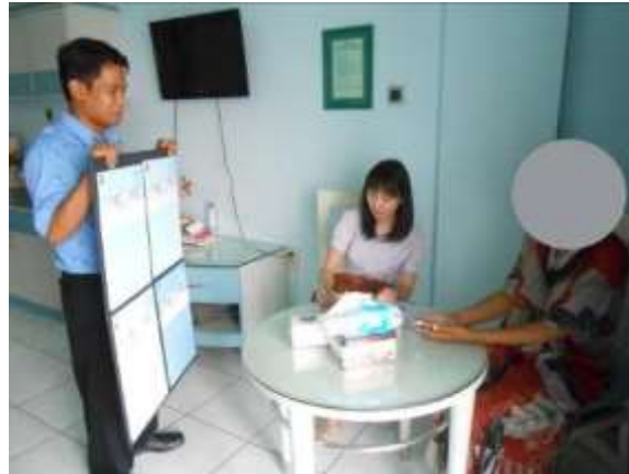
Figure 3. Interview with one of patient's family.