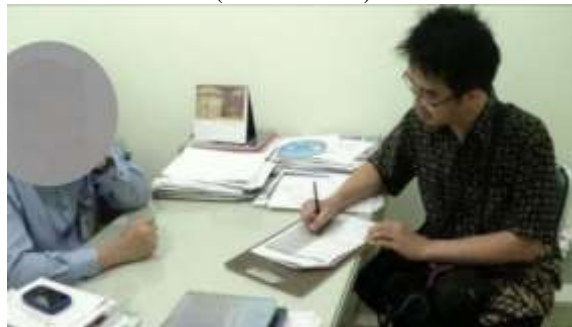
Figure 4. Interview with Doctor.