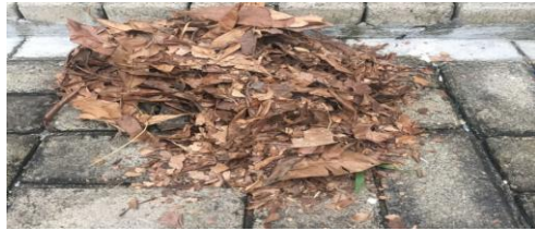
Figure 2. Waste leaves of Cerbera manghas