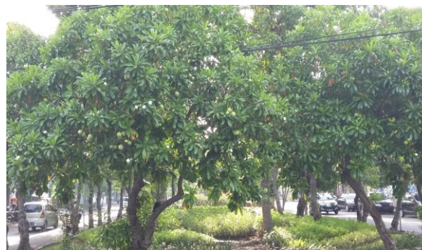
Figure 1. City Park with Cerbera manghas , Surabaya, Indonesia

Trees are the main element in the city park, and they are useful in improving the air quality in densely populated cities such as Surabaya as shown in Figure 1. On the other hand, planting a large number of trees causes a lot of waste from leaves as shown in Figure 2. Government and many communities in Surabaya are facing serious issues with the solid waste leaf from the Cerbera manghas plant. Disposal problems and considerable efforts are being made to reduce the quantities of municipal solid waste.