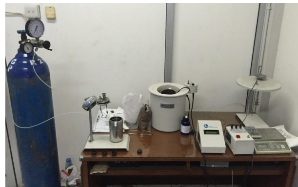
Figure 5. The oxygen bomb calorimeter