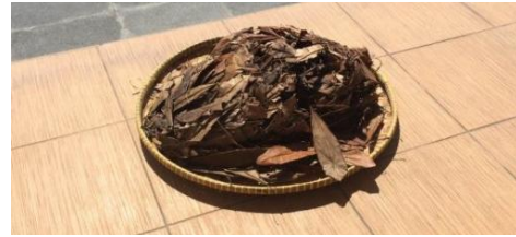
Figure 4. Sun drying Cerbera manghas leaves

These Cerbera manghas leaves waste can be used as an alternative energy through the right process. Previously, there was an experiment regarding biodiesel production from Cerbera manghas , and it proves that Cerbera manghas has potential to be an energy source [8]. Biomass solid fuel can be produced from waste, such as almond leaves, sawdust, coco peat, rice husk, sugar cane leaves, and rice straw. Solid fuel briquette geometries have a different properties such as briquette strength. Solid fuel briquettes are an alternative energy known as biomass energy produced from waste product such as botanical waste and wooden waste. Cerbera manghas leaves contain some chemical composition that may be harmful to living creature. i.e, human beings and animals which assure us that Cerbera manghas is a non-edible plant. Other substances found in Cerbera manghas leaves are p-hydroxybenzaldehyde, benzamide, n-hexadecane acid monoglyceride, loliolide, \beta -sitosterol, cerberin, neriifolin, cerleside A, and daucosterol [9-13]. Because of the various substances in the leaves where the properties of the mixture are unknown, it is important to investigate the fundamental properties of biomass briquettes made of Cerbera manghas leaves waste such as proximate, ultimate, heating value, and the effect of tapioca as a binder material.