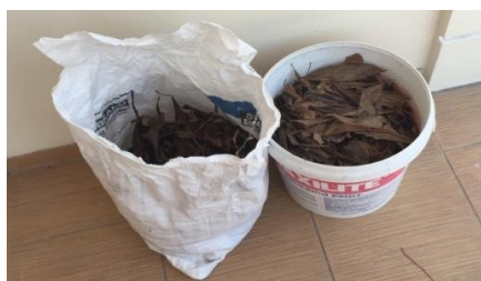
Figure 3. Collecting Cerbera manghas dry leaves

The measurement of heating value of the biomass briquette from Cerbera manghas leaves waste is done using an oxygen bomb calorimeter as shown in Figure 5. Initially, 100% of Cerbera manghas leaves, and 100% tapioca have been measured. All experiments in this paper were performed with mixtures of various tapioca as a binder material from 10% (90% composition of Cerbera manghas leaves) to 50% (50% composition of Cerbera manghas leaves).