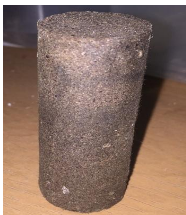
Figure 7. Cerbera manghas leaves briquette

Tapioca which serves as a binder material, reduces the heating value of the biomass briquette from Cerbera manghas leaves waste. The greater amount of tapioca, the lower the heating value of the briquette. In terms of cost, the most economical composition is also found in 90% Cerbera manghas leaves, and 10% tapioca mixtures. It is because the leaves waste cost nothing while the tapioca cost about 0.5 USD/kg (the price of tapioca in Indonesia is about 0.5 USD/kg in May 2016). The higher the percentage of tapioca in the biomass briquette from Cerbera manghas leaves waste the higher the cost of the briquettes.