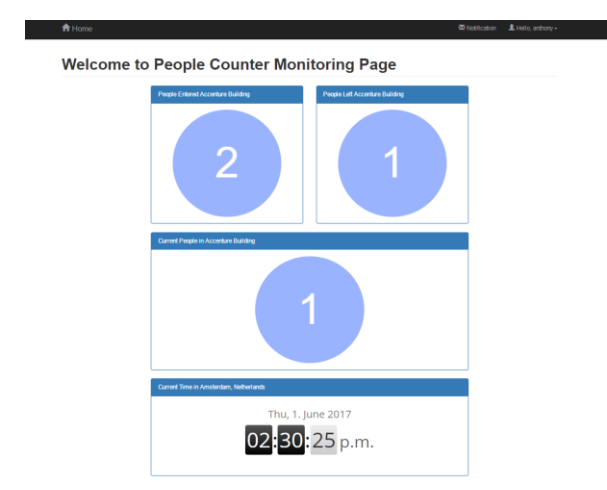
Figure 3. Homepage Web Application

The web-application can get the data from AWS IoT and show it in the home page of the webapplication. REST is used as the API to get the state from device shadow. There is a PHP script that continuously runs in the server to keep comparing the state in device shadow with the local database of the web-application. Whenever the data is different, the script will update the data in the local database. On the client side, the page will be refreshed when the data that is shown on the home page is different with the data in the database.