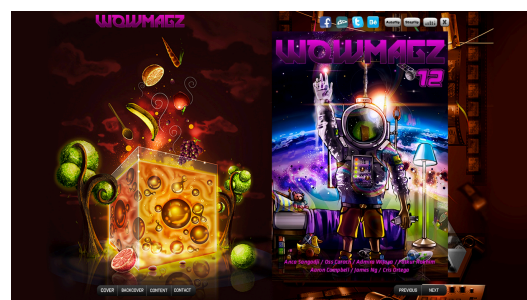
Fig. 03 The cover of WOWMAGZ. It use more function buttons than NatGeo

From the National Geographic on the iPad (National Geographic 2010) video preview, we can see that on the bottom of the screen, there are highlights of the previous and next pages. This kind of navigation is helpful and effective. The reader can just slide the page using their finger. National Geographic also applies various contents in the publication, from the conventional ones (text and image) to the electronic ones (video, animation / motion graphics). It also includes the links to the other contents like NatGeo website, atlas map, and games.