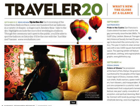
Fig. 02 The National Geographic content shows up in 2-pages portrait format (National Geographic 2011)

National Geographic applies the portrait format, similar to its print version, on the iPad version. The format shows the contents each two pages on iPad in landscape mode.