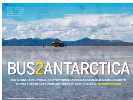
Fig. 01 The basic display of National Geographic iPad magazine (National Geographic 2011)

Visual research was conducted during the process. National Geographic iPad magazine and WOWmagz are the e-publications used in the visual research