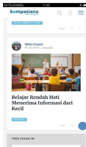
Picture1 : Kompasiana Overview

Related to the practice of citizen journalism, there is an interesting phenomena in Indonesia. Beside non mainstream channels such as personal blog and personal social media, even the involvement of mainstream media in case of opening channel to acomodate the desire of citizens journalists to involve in delivering news. One of any media which plays a role in developing the practice of citizen journalism is Kompasiana. Kompasiana remains consistent with either format of writing or opinion which comes from personal thought and runs with website format.