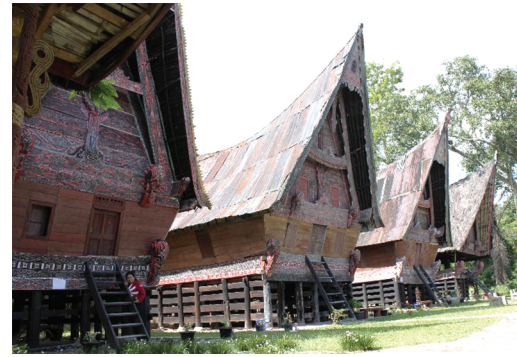
Fig. 2. A Batak Toba house with the traditional gabled roof.