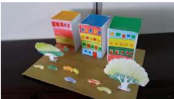
Figure 17. Result of 3 Dimensional models created by elementary students and PCU students.

These activities gave benefits to the students to understand more on the healthy-ideal city life. The students became interested in taking simple green initiative, taking care of the natural environment in healthy-ideal city especially in their home's setting. The students' imagination and creativity were also sharpened while creating 2 dimensional and 3 dimensional arts/craft about the healthy city and healthy homes. The visually impaired students learned about the spatial arrangement of the healthy home with 3 dimensional model.