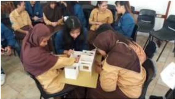
Figure 15. The Storytelling with assistance of 3 dimensional healthy home to the visually impaired students.