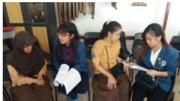
Figure 13. Storytelling with assistance of 3 dimensional healthy home to the visually impaired students.