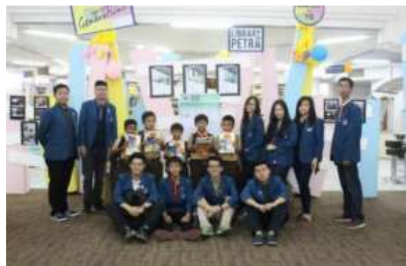
Figure 6. The Result of painting workshop with elementary students