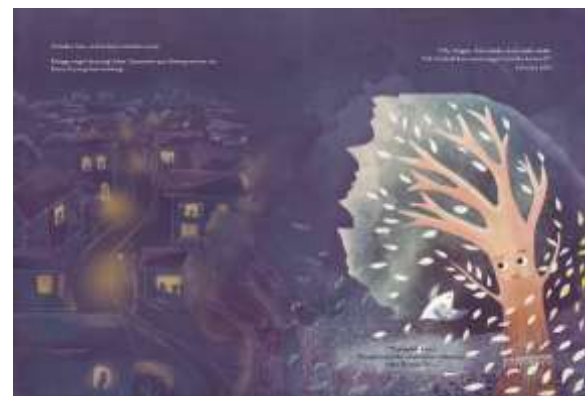
Figure 3. Sample of the book illustration on the Taman Cahaya (Park of Lights),