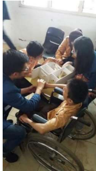
Figure 12. Storytelling with assistance of 3 dimensional healthy home to the visually impaired students.