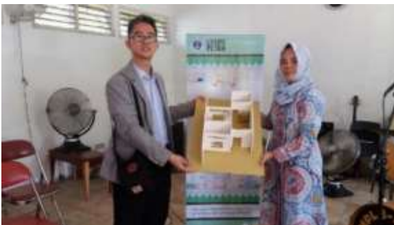
Figure 16. Handover of books and 3 dimensional architectural model for YPAB junior high school