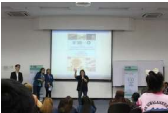
Figure 4. Welcoming speech from the Head of Library@Petra

The program was prepared in 3 months, in collaboration of Library @ Petra, Architecture Program and four schools and external supporting team. The activities were done by community service team consisting of 6 persons, and approximately 200 undergraduate students. The activities were held in 21 st April, 22 nd April, and 28 th April, 4 hours each day. Some activities are described in the following pictures.