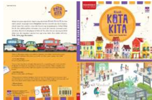
Figure 1. The book cover design, which is very interesting, attracting the children to read the book.

The illustrations of the book are found very interesting and could be easily understood by the children.