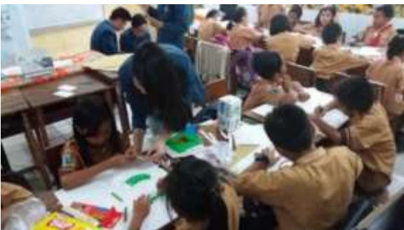
Figure 11. Making 3D model houses together with elementary students