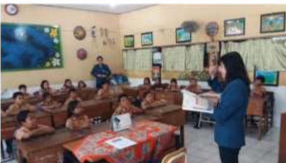
Figure 10. The Storytelling and reading session of “Kisah Kota Kita” book.