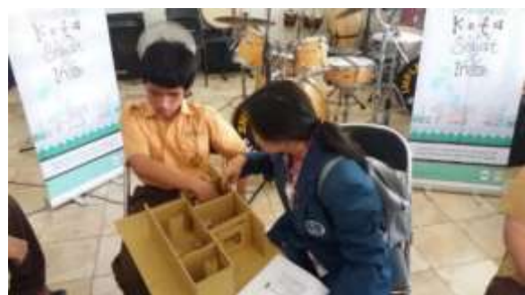
Figure 14. The Storytelling with assistance of 3 dimensional healthy home to the visually impaired students.