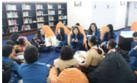
Figure 7. The Storytelling and reading session of “Kisah Kota Kita” book.