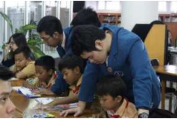
Figure 8. The Storytelling and reading session of “Kisah Kota Kita” book.