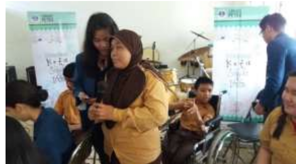
Figure 18. Poetry reading about Healthy Home, created by junior high school students.

The teachers of elementary school and inclusive junior high school received new books and arts/craft tools to be used as the teaching material for healthy city topic. They also learned about how to create fun and interesting educational event with environmental awareness material.