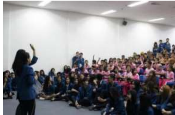
Figure 5. The Interactions between students - participants.