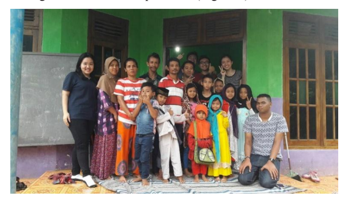
Fig. 2. Students were having a photograph with the family after the survey.

Industrial Statistics II Class helped in collecting data from the survey. They went into groups to those villages and meet the respondents (Figure 2).