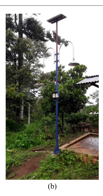
Fig. 5. (a) Narrow and bad road condition at Nawangan village and (b) solar cell installed in one communal toilet in Nawangan village.

All the facilities which were built during COP are still working well and they take good careand use them daily. However, there are some of the facilities built during the COP are currently broken, i.e. the solar cell lighting. (Figure 5(b)). They hope that the COP can be better and better in the future with more participants will come to join and they will stay longer in their village. Moreover, they also expect that every household in the village can have experience to be a host parent for COP participants. Besides, they wishthat the participants can be more engaged with the host and will not only be occupied with the program they have to complete.