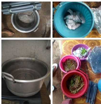
Image 2. Preparation: materials and equipment supported by villagers

This training activity focuses on aspects of developing creativity and increasing women's skills to be productive and independent. In the preparation stage, it is carried out through exploration, observation and interview activities to women who are targeted by the activity. Exploration and observation activities are useful for students and villagers to understand the characteristics of teak leaves which can be used for the ecoprint training. This exploration activity was carried out in a teak forest not far from where the villagers lived. Observations were made to find out the daily activities of women in Ngembat, to find out what they were doing during their free time. Interviews were conducted within a number of women, the village head and the sub-village head of Ngembat to find out about the problems faced and discuss alternative solutions. The village head and the sub-village head of Ngembat welcomed the training, because it was considered to be able to provide new knowledge and skills to women in the Ngembat sub-village. Previously, no such activity had been carried out. The sub-village head volunteered to help provide the materials and equipment needed during the training. As well as taking the initiative to invite and motivate villagers to participate.