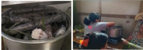
Image 5. Documentation of steaming the fabric and teak leaves process