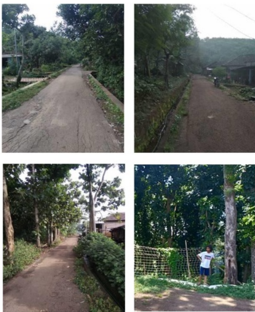
Image 1. Ngembat Sub-Village surrounded by teak forest

are still low motivation for entrepreneurship since the people came from low-educated background. Income is generally low in this sub-village as majority of the people tend to become farmer than opening their own business. That caused the villagers to be very dependent on natural resources. Almost all women in Ngembat are unproductive and do not have their own income. Everything depends on the husband who works as a farm laborer and a builder. Everyday they are responsible for household chores and matters such as cooking and caring for children (or grandchildren). The free time available is used to gather with fellow housewives, just to chat. There were no initiatives from women in Ngembat sub-village to become entrepreneurs so they could support household income. Because they feel have not enough knowledge and skills. They feel insecure, low self-esteem, and feel unable to work because of the low level of education pursued. Knowing that, women in Ngembat content themselves with just being a housewife.