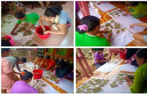
Image 3. Documentation of arranging teak leaves on fabric