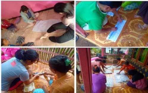
Image 4. Rolled fabric that has been arranged teak leaves in it with