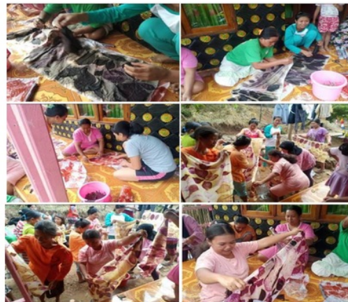
Image 6. Documentation of unroll the cloth, clean the remaining teak leaves and lock the color with alum water

The whole activities was carried out in the home of one of the villagers. Voluntarily, also providing her kitchen, lending pots and stoves to support the steaming process. While waiting for the steaming process, some of the trainees must return home to cook lunch for the family, take clothespins and pick up children from school. After the steaming, the trainees were enthusiastic about the final results of the ecoprint, they hoped the results would be satisfactory. After the rolled cloth has been removed separated from the plastic and the remaining leaves attached, the cloth is rinsed in alum water, this process is called fixation. Then they can be dried in the sun.