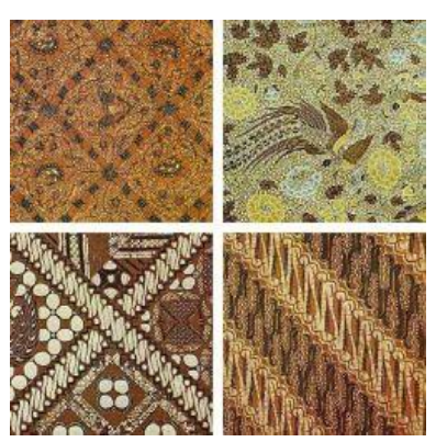
Figure 2. Modern Batik Motifs