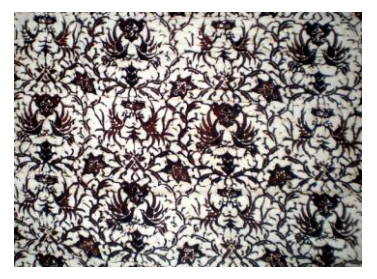
Figure 1. Parang and Sidodrajat Motifs

On the other hand, Batik Saudagaran is batik consist of motifs that can be worn by civilian and available for trading. Modern batik, that freely trade nowadays may included in this type of batik. Modern batik can be viewed from several points of view. First it may considered as modern batik from the sense of motif (as if making a new pattern or modifying previous traditional motifs) and second reason from the technique it made (modern stamp or even print). Modern batik generally have more "pop" motifs and mass-product oriented which may neglect some values in traditional batik making process.