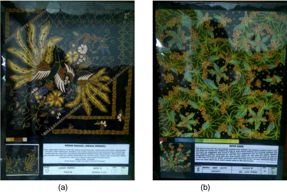
Figure 3. (a) reconstruction of "Batik Merak Ngigel" (b) reconstruction of "Batik Bada" designed by Interior Design Petra Christian University Students of 2010

Here are some of students batik modifications based on previous traditional batik pattern: