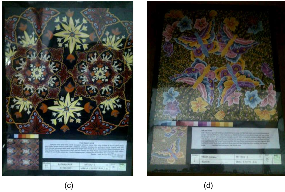
Figure 4. (c) reconstruction of "Batik Ceplok" (d) reconstruction of "Batik Hokokai" designed by Interior Design Petra Christian University Students of 2010