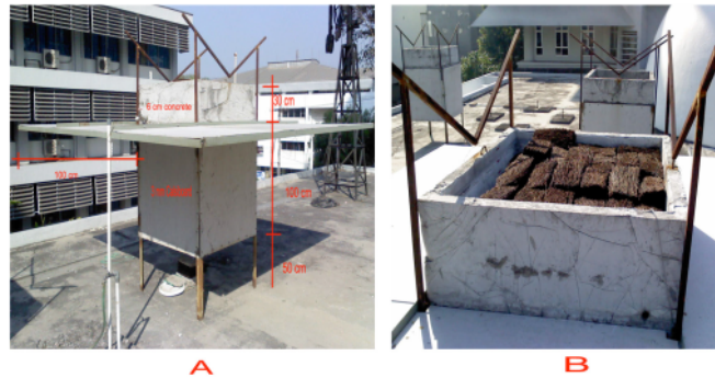
Source: (Mintorogo, 2010) Figure 4: A. The model, B. Covered model with Pakis-stem Blocks