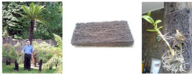
Figure 2: Pakis Trees, Pakis-Stem Blocks, and Orchid on Pakis Block

Applying rows of pieces of Pakis blocks over the flat rooftop concrete as external environmental friendly insulation, the room thermal will be controlled diminishly. Pakis-stem blocks are used by orchid flower users that they attach the orchids on Pakis block and Pakis blocks are sold at flower shops. Those Pakis blocks come from Pakis trees which could be found at the jungle; the Pakis stem is then be sliced onto pieces of Pakis blocks.