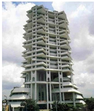
Figure 8. Wisma Dharmala by Paul Rudolph (1987)