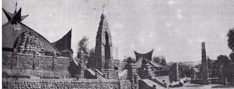
Figure 6. Puhsarang Church by Henri MacLaine Pont (1936)

Meanwhile, in The Architectural Regionality View Of Culture , Xu suggests that regionality can be identified from the appearance and cultural views [9], while Xia Di, said to understanding the Regionality of architecture and city under Globalization Context with knowing the Objective Existence and Subjective Expression [10]. Thus, when regionality it appears in a building may be identities or characteristics of places and cultures where the building is established.