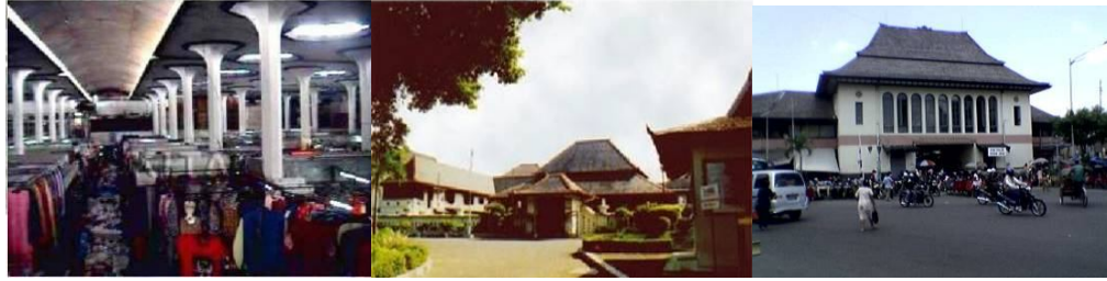
Figure 3,4,5: Thomas Karsten, shows the identity and characteristics as a function of tropical and local characteristics.