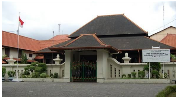
Figure 7. Museum Sosobudoyo by Thomas Karsten (1939)