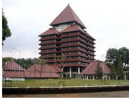
Figure 9. Rectorate, Universitas Indonesia's main building, Gunawan Tjahjono (1987)

Learn from the experts and learn from the work of the architects' then get a sense of regionality architecture can be observed from the side view of the buildings and the feel or atmosphere that is felt by others who view or use.