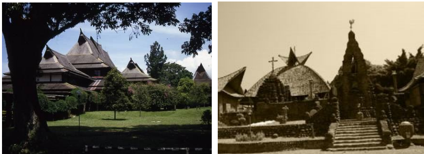
Figure 1 and 2: Show local characteristics where the work is constructed

Like most of the building / architectural masterpiece that is currently designed by the architect is already showing its local characteristics, it is this which will be the focus of this study. Some examples of the work of the architects of the building and the architect outside Indonesia to show its local traits, among others: