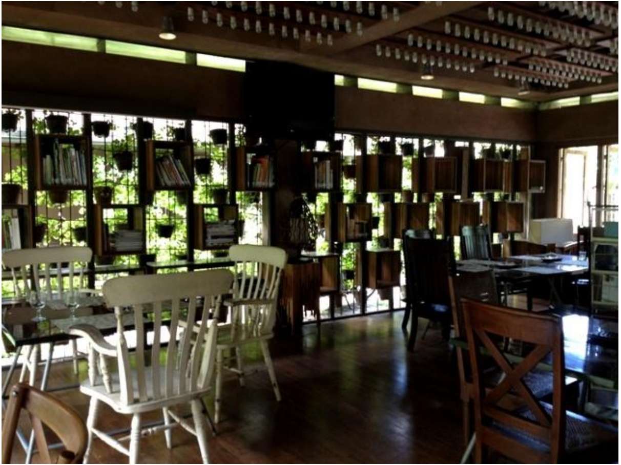
AGB