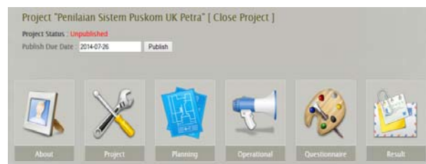
Figure-4. Sub-Menu Choose Project.

Selection of projects can be done by selecting the menu 'Choose Project', and will display the sub-menu option that can be seen in Figure-4. If the selected Project is a new project, the 'Operational', 'questionnaire', and 'Result' can't be selected before the Planning process is executed. This is an additional feature that can help the administrator to make the design process appropriate with the existing order.