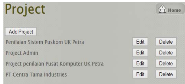
Figure-3. List of Existing Projects.

After selecting the menu 'Project', it will display a list of projects that have been, or could choose to add the new project. An existing project can be renamed or deleted. The new project can be added by selecting the 'Add Project'. Menu 'Project' can be seen in Figure-3.