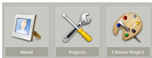
Figure-2. Home Menu.

At this stage the administrator could choose an existing project or create a new project. The initial process will show 3 menu are: About, Projects, and the Choose Project. 'About Menu' featuring Team Software Developers 'Projects Menu' displays existing projects and Administrators can create new projects, and 'Choose Project' featuring a selection of existing projects. Design menu on the main page can be seen in Figure-2.