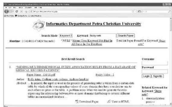
Figure 10. Search engine which involves keyword attach to paper with more than one word/phrase keyword input

Search engine implementation which involves keyword attach to paper with more than one word/phrases input can be seen in Figure 10.