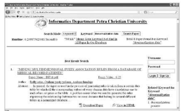
Figure 6. Ordinary type of fuzzy search with more than one work/phrase keyword input

Ordinary type of fuzzy search implementation with the input of more than one word keywords/phrases can be seen in Figure 6.