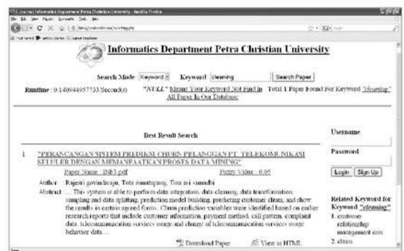
Figure 5. Ordinary type of fuzzy search with a single word keyword input

Searching by ordinary fuzzy type is a search that only looks for keywords in the paper, inputted by the user. Ordinary type of fuzzy search implementation with a single word keyword input can be seen in Figure 5.