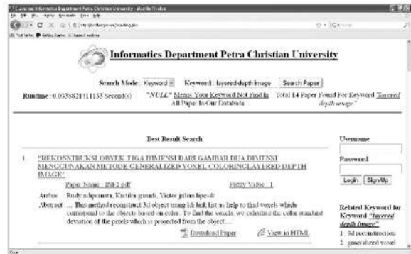
Figure 4. Extended type of fuzzy search with keyword input - more than one word/phrase

The implementation of an extended type of fuzzy search with a keyword input more than one word/phrase can be seen in Figure 4.