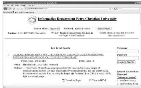
Figure 9. Search engine which involves keyword attach to paper with one keyword input

Searching involving keyword attached to paper is a searching process performed on the input found on the library tables. This Search use extended fuzzy type because the keyword input is found in the library table. Search engine implementation involves keyword attached to paper with one word keyword input can be seen in Figure 9.