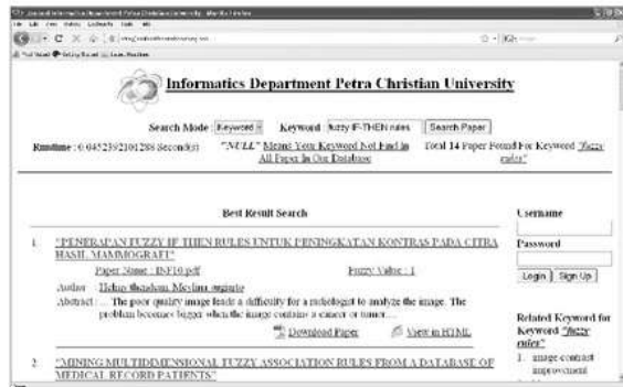
Figure 8. Search engine which involves symbol and stop word with more than one word/phrase keyword input

Search engine implementation which involves symbols and stop word to the keyword input of more than one word/phrases can be seen in Figure 8.