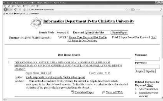
Figure 7. Search involve symbol and stop word with one word keyword input

The Implementation of the search involving symbol and stop word with one-word keywords can be seen in Figure 7.