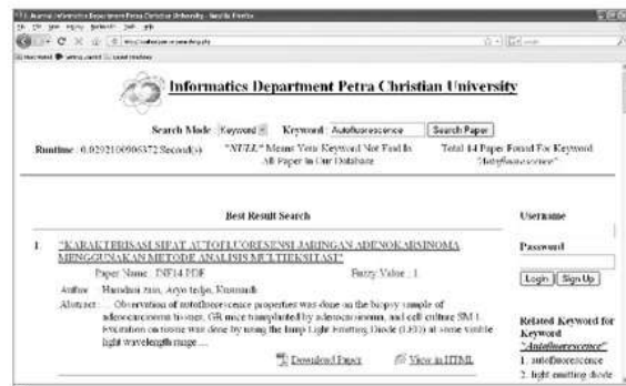
Figure 3. Extended type of fuzzy search with keyword input - one word

Search by extended fuzzy type is a searching type which looks for related papers of related keywords that are input by the user. The implementation of an extended type of fuzzy search with keyword input - one word can be seen in Figure 3.