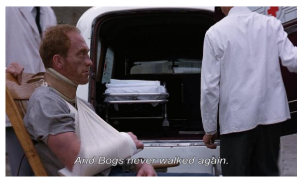
Screenshot 11. The effect of structure of domination to Boggs