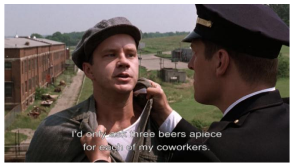
Screenshot 1. Andy's agency and the risk of being pushed off the roof

inmates was changed too. Since that day Andy's inmates respected and supported Andy, even the prison guards protected him from being bullied by Bogs (a fierce inmate) and his gangs. This example shows that even though Andy's agency can make a change on the relation of the inmates with the guards and among the inmates, it still needs the approval of Captain Hadley to accept Andy's offer and to grant his request. This shows an interlocking relation between agency and structure.