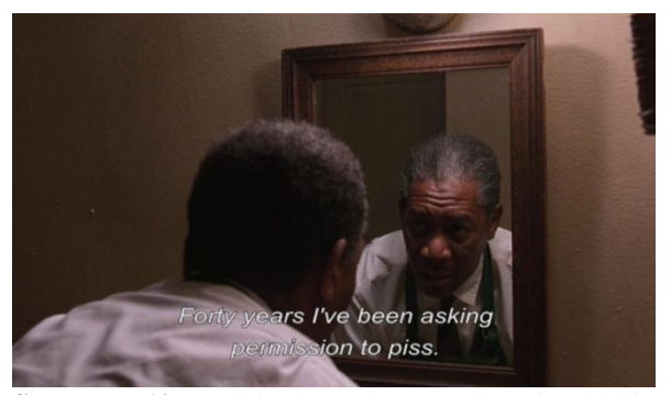
Screenshot 10. Routinization as the grounding of social life

In Red's case, although the role of structure was so strong, helped by Andy's agency, Red's agency appeared as he finally chose not to buy a gun and committed a crime again to be sent back to the prison. His consciousness and purposiveness enabled him to break loose from the grip of prison structure. This example shows again the interplay of Red's agency vis-a-vis prison structure.