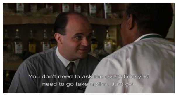
Screenshot 9. Institutionalization of structure

Giddens (1986) said about the basic requirement of social systems: "The structural properties of social systems exist only in so far as forms of social conduct are reproduced chronically across time and space. The structuration of institutions can be understood in terms of how it comes about that social activities become 'stretched' across wide spans of time-space" (p. xxi). Further he said that the "fundamental concept of structuration theory" is routinization (p. xxiii). This is what Red experienced, which he called as being "institutionalized" for forty years (Screenshot 9).