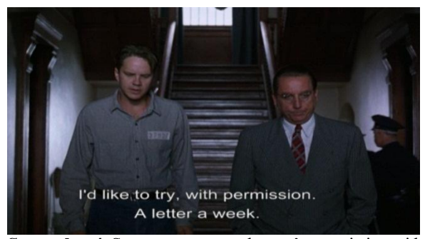
Screenshot 4. Strong structure and agent's negotiation with Warden Norton

As Warden Notron himself said that there were only three ways to spend the taxpayers' money for prison, namely for more walls, more bars, and more guards, which meant that a request for more books was sheer impossible. However, through his agency, Andy tried to negotiate with the Warden to get a permission to write letters. Actually, Warden Norton gave Andy a permission to write letters only to make him happy, but finally Andy's request was granted. This example shows that Andy's agency can change a part of the prison structure regarding the library although he needs to negotiate with the warden (representing the structure) to get the permission to write the letters. Thus, it shows that there is an interplay of Andy's agency and the prison structure.