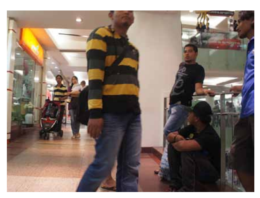
Figure 6. Visitors sitting in circulation path at Tunjungan Plaza 3

Related to the fact of no sitting room or sitting area in Tunjungan Plaza 1 and Tunjungan Plaza 3, and based on the visitor interview result, it is shown that they need these kind of sitting facilities for free. When they are waiting for their girlfriends, wives, or friends, they do not have to wait in a cafe or restaurant. They also want to be facilitated with the public sitting area, so when they have to wait, or meet a friend up, or just relaxing in a mall, they can just sit and enjoying the mall atmosphere. For some visitors, a mall atmosphere alone is already an interesting entertainment.