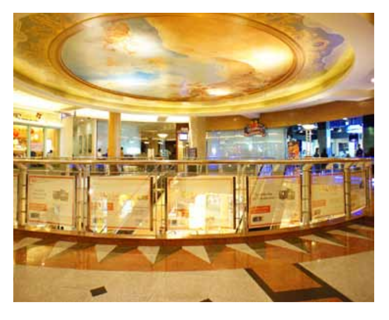
Figure 8. Artwork at the ceiling of Tunjungan Plaza 4

This condition in fact has made the mall visitors happy, according to their opinion the atmosphere has become less monotonous, and this condition has become one of their reasons visiting Tunjungan Plaza.