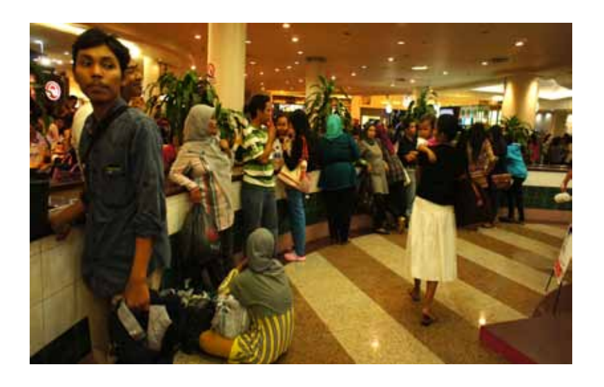
Figure 5. Visitors in Tunjungan Plaza 3 take a rest standing and sitting on the circulation area while enjoying the atmosphere of the mall. This situation annoys other visitors who need to pass.