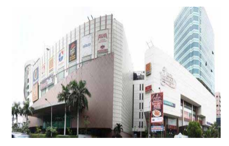
Figure 2. Shopping Mall 'Tunjungan Plaza' (http://tunjunganplaza.com/front/aboutus).

There are some factors to succeed Tunjungan Plaza as a shopping mall like its location, brand name, and the timing of establishment. Tunjungan Plaza is located in the center of Surabaya, Tunjungan Plaza's brand name is so popular in East Java society, and Tunjungan Plaza is established when the trend of modern shopping malls began in US and Asia [6].