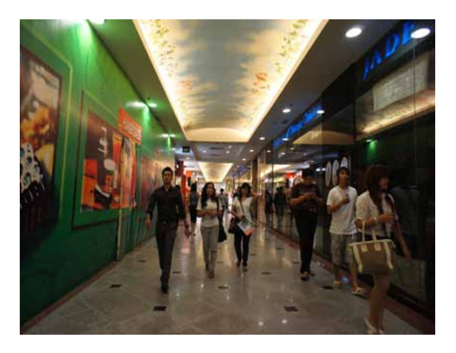
Figure 9. Artwork at the ceiling of Tunjungan Plaza 4