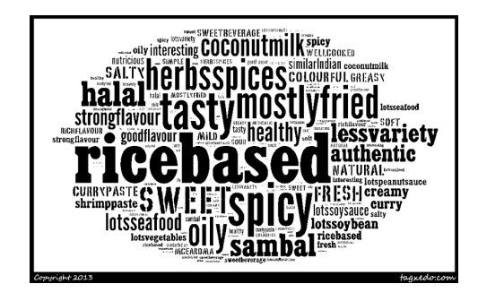
Fig. 1 The most frequently occurring words that appear in the combined responses relating to characteristics of local Indonesian food

Although the majority of participants stated that they visited Indonesia for the first time, most of them (78.8%) had heard about local Indonesian food before their actual visit. It is more likely that respondents received information pertaining to local Indonesian food verbally by word-of-mouth (WOM) from their friends, family or relatives, rather than from written sources like magazines or newspaper articles about Indonesian cuisines. Participant preconceptions were examined based on their knowledge about the most salient characteristics of local Indonesian food. The finding is illustrated in the form of tag clouds at Figure 1. The larger font size of words in the tag cloud indicates the more frequent the characteristics being mentioned by the participants.