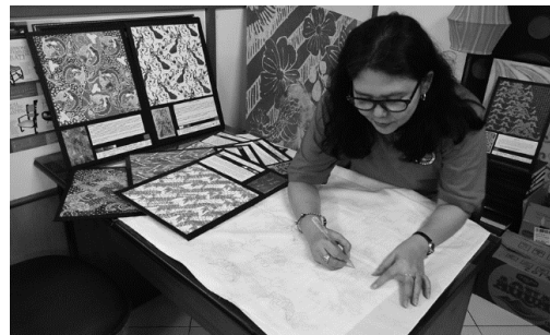
Figure 7. Pattern making process on the Mori Primisima cloth.

Generally, a batik pattern consists of three main elements: klowongan , isen-isen and pengisi . Klowongan is the primary ornament or pattern, isen-isen or isen is the content pattern of the primary ornament ( klowongan ) while pengisi is the additional filling or background pattern that functions as a balance to the primary ornament in order to produce a harmonious combination (Doellah, 2002). An example of batik motif pattern and composition developed in this research is shown in the following figures: