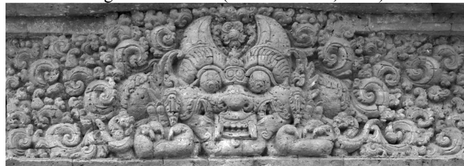
Figure 3. Kalamakara Motif on Candi Bajang Ratu, surrounded by typical Majapahit ornaments of spreading tendrils (Photo: Author, 2015).