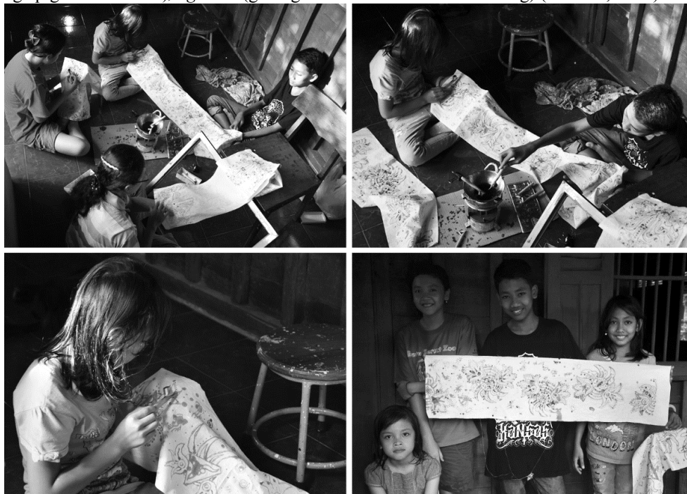
Figure 11. Practice in making mbatik klowongan patterns with primary 5 and 6 school children in the researcher's home. The technique of batik making needs to be introduced to the young generation from childhood. The skills of batik making are passed down through demonstrations and verbal explanations. The study process was developed through looking, observing and direct practicing on site (Photo: Author, 2015).

The mbatik pesisiran process was used in the experiment of this research consisting of: mbatik (making patterns on the mori or cloth by applying batik wax using canthing tulis ), nyolet (giving colour to certain parts by dabbing coloured pigment solutions on those parts), nutup (covering the parts that have been dabbed with batik wax), ndhasari (soaking the background pattern with desired coloured pigments), covering of the dasaran (covering the areas of the background pattern that has already been coloured), medel (soaking in blue colour), nglorod (getting rid of all the wax on the mori or cloth in a tub of boiling water and yielding coloured kelengan ), nutup and granitan (covering the areas that has been coloured and the parts that would be left white as well as making white dots on the lines outside the outer pattern known as granit with batik wax), nyoga (soaking in brown or soga pigment solution), nglorod (getting rid of all the wax with boiling) (Doellah, 2002).