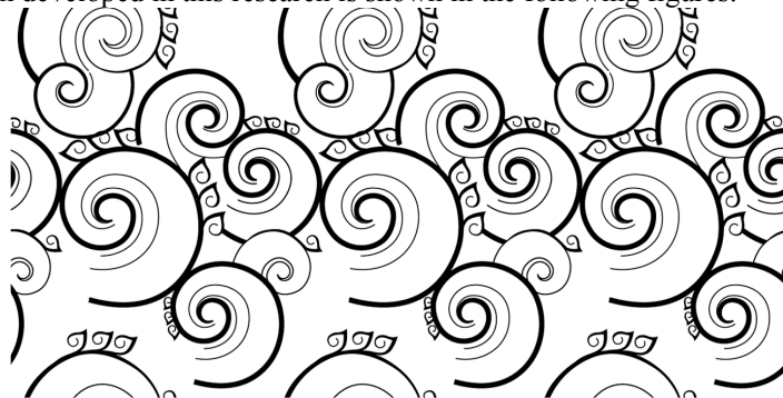
Figure 8. The primary ornament ( klowongan ) forms the main batik pattern arrangement. This klowongan was inspired by the tendrils found on the candi (Designed by Wardani, 2015).

Generally, a batik pattern consists of three main elements: klowongan , isen-isen and pengisi . Klowongan is the primary ornament or pattern, isen-isen or isen is the content pattern of the primary ornament ( klowongan ) while pengisi is the additional filling or background pattern that functions as a balance to the primary ornament in order to produce a harmonious combination (Doellah, 2002). An example of batik motif pattern and composition developed in this research is shown in the following figures: