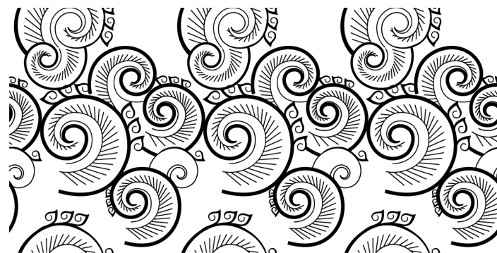
Figure 9. The primary ornament ( klowongan ) with secondary ornaments ( isen ) to fill in the primary parts (Designed by Wardani, 2015).