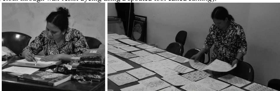
Figure 6. The process of creating and selecting motifs for experiments on Batik patterns and compositions. Design criticisms were performed in order to select the best composition, which would be developed and applied on the real batik media later.

Developing batik design requires much creativity and this could be seen in the design process and the product of the batik motif arrangement. Design experiments started with the selection of motifs as the source of idea and development, followed by novel creations of motifs through freehand sketches and then continued by the organization or arrangement of motifs into a pattern and composition using computer tools as the media. The patterns were then experimented on Mori Primisima cloth with the traditional technique of mbatik (drawing batik motifs on a cloth through wax-resist dyeing using a spouted tool called canting ).