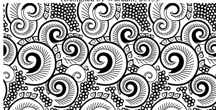
Figure 10. The primary motifs and patterns have been given additional patterns surrounding them ( pengisi ) that act as a background to balance the primary ornaments (Designed by Wardani, 2015).

Following the motif and pattern arrangement making stage, the experimental activities were followed by the process of batik making using the canting (a spouted tool used to draw patterns with wax on batik textiles).