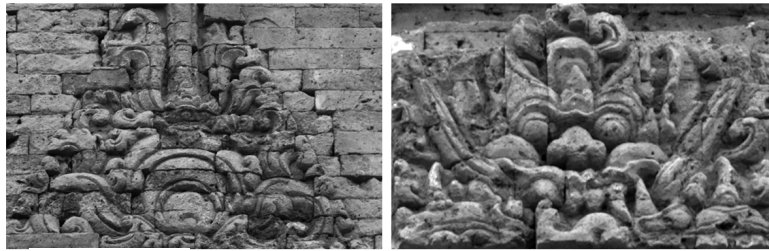
Figure 2. Left: Kala Ekacaksu / Monocle Cylop / relief one-eyed kala motif on Candi Bajang Ratu. Right: Kala motif.