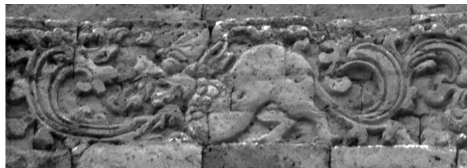
Figure 4. Lion motif on Candi Bajang Ratu.