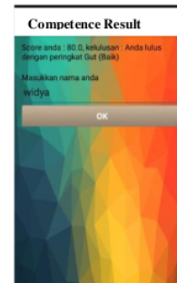
Fig. 11. Competency test result.

In Fig. 11 score Board is divided into 2, score board for quizzes and for competency test. Each featuring top 10 best scores and user name.