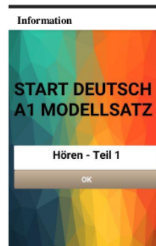
Fig. 9. Divider page.

Deutsch A1 simulation test which consists of three categories that appear in sequence, namely Hören (listening), Lesen (reading), and Schreiben (writing). Hören and Lesen consists of 3 teil (part) while Schreiben only consists of 1 section. When will move to the next categories or sections, the divider page will be displayed. The divider page can be seen in Fig. 9. Especially for Hören section, the play button to play the sound will be displayed. Competency test page can be seen in Fig. 10, and test result page can be seen in Fig. 11.