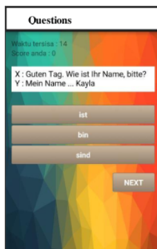
Fig. 6. Grammatik and Wörter.

Quiz page consists of 3 types of quizzes, Grammatik (about grammar, where user will be asked to fill in the blanks of a sentence or a dialog with three possible answers), Wörter (about the writing / spelling of the word, which user will be asked to choose from two options), and Buchstabieren (about the words that are usually used in a given situation, the user will be asked to fill in the blanks of a sentence or a dialog with three possible answers). The quizzes have a maximum of 15 seconds to choose the correct answer. Here can be seen Grammatik and Wörter page view in Fig. 6, Buchstabieren page view in Fig. 7, and the quiz result in Fig. 8.