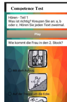
Fig. 10. Competency test.