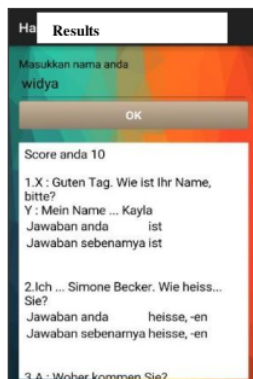
Fig. 8. Quiz result.

Competency test page is the page that contains the Start