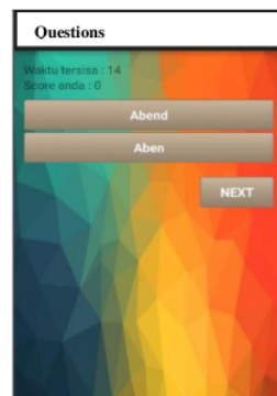
Fig. 7. Buchstabieren.