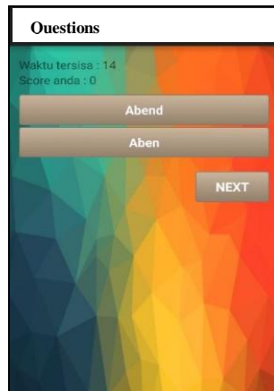
Fig. 7. Buchstabieren.