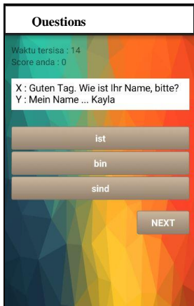
Fig. 6. Grammatik and Wörter.

Quiz page consists of 3 types of quizzes, Grammatik (about grammar, where user will be asked to fill in the blanks of a sentence or a dialog with three possible answers), Wörter (about the writing / spelling of the word, which user will be asked to choose from two options), and Buchstabieren (about the words that are usually used in a given situation, the user will be asked to fill in the blanks of a sentence or a dialog with three possible answers). The quizzes have a maximum of 15 seconds to choose the correct answer. Here can be seen Grammatik and Wörter page view in Fig. 6, Buchstabieren page view in Fig. 7, and the quiz result in Fig. 8.