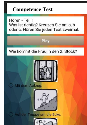
Fig. 10. Competency test.