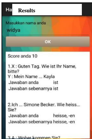
Fig. 8. Quiz result.

Competency test page is the page that contains the Start