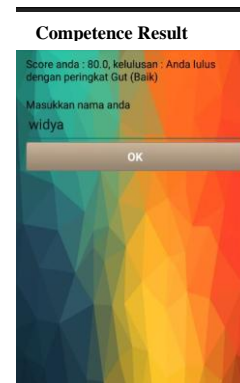
Fig. 11. Competency test result.

In Fig. 11 score Board is divided into 2, score board for quizzes and for competency test. Each featuring top 10 best scores and user name.