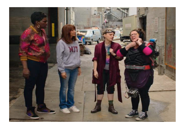
Picture 5. Patty's clothing difference from the other members' clothes.

Fashion is an object that can illustrate how crucial tensions in society. Fashion is a result from upper social classes' need to distinguish themselves from lower social classes (Godart, 2012, p. 24). That is why through fashion people can tell someone's culture and class, so does Patty's fashion compared to the other members.