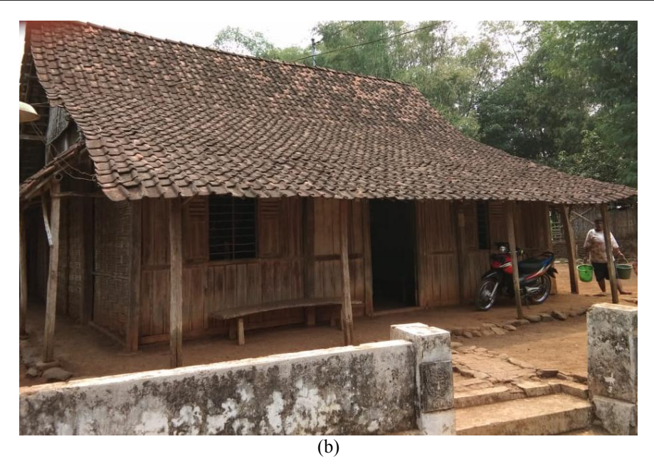
Fig. 3. (a) The profile of the respondents and, (b) the housing condition in Jatidukuh village.