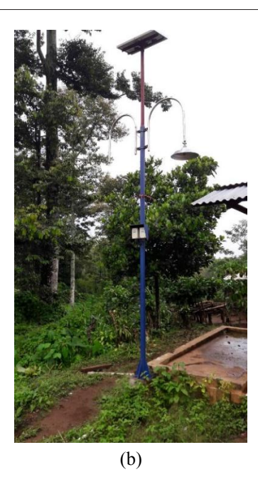
Fig. 5. (a) Narrow and bad road condition at Nawangan village and (b) solar cell installed in one communal toilet in Nawangan village.

All the facilities which were built during COP are still working well and they take good careand use them daily. However, there are some of the facilities built during the COP are currently broken, i.e. the solar cell lighting. (Figure 5(b)). They hope that the COP can be better and better in the future with more participants will come to join and they will stay longer in their village. Moreover, they also expect that every household in the village can have experience to be a host parent for COP participants. Besides, they wishthat the participants can be more engaged with the host and will not only be occupied with the program they have to complete.