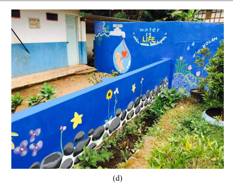
Fig. 1. Physical programs implemented during COP (a) building bio sand water filterin Jatidukuh village, (b) renovating public toilet, (c) public toilet after renovation, and (d) mural activity in the public toilet in Gumeng village.