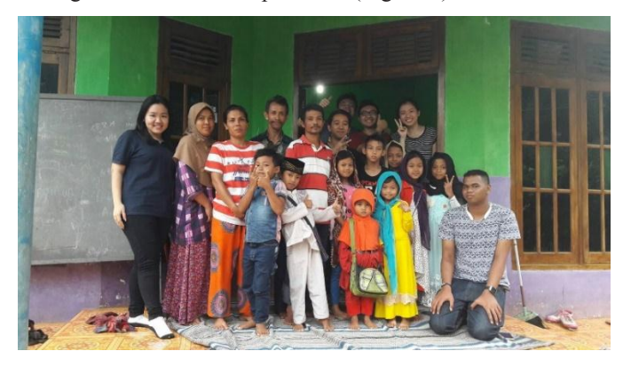
Fig. 2. Students were having a photograph with the family after the survey.

Industrial Statistics II Class helped in collecting data from the survey. They went into groups to those villages and meet the respondents (Figure 2).