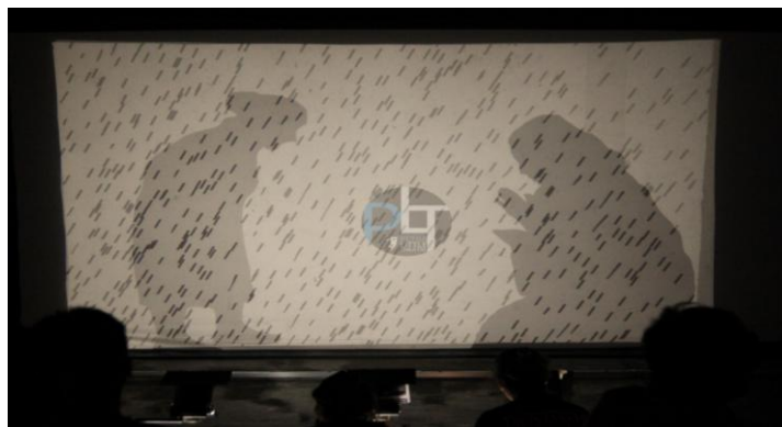
Picture 2. The Legend of Batu Menangis group doing a scene where the daughter turns into stone during a storm.

The third aspect which highlights our students' creative thinking skill was the special effects. Special effects are an important element in any performance because they are excitement-inducing, and OP is no exception, especially because the artists are working with limiting technology. The Danau Toba group managed to change Toba's and the lady-fish's eyes into heart-shaped ones to symbolize how much in love they were. This was done by creating two heart-shaped holes as the puppets' eyes and covering them with a piece of paper until the moment came for the students to pull the paper and reveal the heart-shaped eyes. (Logbook, November 29, 2017). The Legend of Batu Menangis group cleverly adhesive-taped three transparent plastic sheets with raindrop prints on them into one long sheet and ran it in a steady pace to show a never-ending rain pour, while one of them turned the daughter puppet into stone by slowly pulling up the plastic attached to the legs of the puppet which already turned into stone, covering more parts of its body with stone-shaped paper (Logbook, November 29, 2017). It was amazing to witness how creative these young people were to innovate when they knew the goal that they would like to achieve.