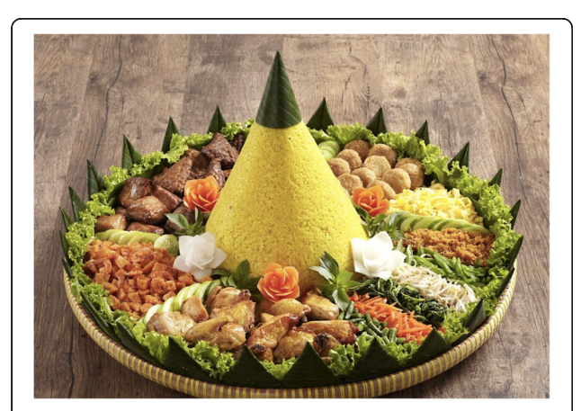
Fig. 3 Nasi kuning tumpeng. Nasi tumpeng is a large cone-shaped yellow steamed rice dish with side dishes of vegetables and meat originating from Javanese cuisine of Indonesia. It is traditionally featured in a religious ceremony as a symbol of thanksgiving to gods of nature. Nasi tumpeng comes from an ancient Indonesian tradition that revers mountains as the abode of the ancestors and the gods. Rice cone is meant to symbolise the holy mountain. The feast served as some kind of thanksgiving for the abundance of harvest or any other blessings. In today's society, nasi tumpeng is a common dish served in various events of corporates, personal, and other organisations, holding the same philosophy for gratitude expression (picture was

The final phase is the contemporary culinary phase where the food habits of Indonesian people have been pretty much influenced by the rapid development of