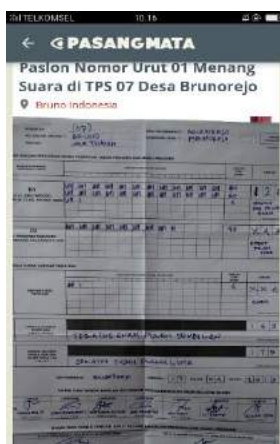
Image IV: "Paslon Nomor Urut 01 Menang Suara Di TPS 07 Desa Brunorejo"