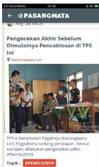
Image 1 : "Pengecekan Akhir Sebelum Dimulainya Pencoblosan di TPS ini"

Judging from the value of journalism, the power of photojournalism is indeed the visual side but the informative aspect is no less important. As many as 11 photos of the "Mata-Mata" of the PasangMata.com did not meet the informative aspect. The completeness of the informative aspects of a journalistic photo is mainly on the aspects of who and what and other elements can be conveyed in a caption (photo caption). Some photos of the "Mata-Mata" in PasangMata.com are still unable to show in detail and complete information that needs to be known from an event. For example photos with the title "Pengecekan Akhir Sebelum Dimulainya Pencoblosan di TPS ini". From the photos it can be seen the unclearness on who did the final check whether it is the KPPS Officer or the witness or from which party. And in the Caption also not mentioned the element of "Who" who carried out the final checking activities.