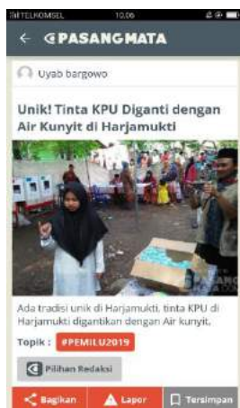
Image II : “ Unik! Tinta KPU Diganti dengan Air Kunyit di Harjamukti”

Factual aspects become an absolute requirement for photojournalism. 2019 election events are categorized as events that are hardnews or events that must be reported immediately. Factual refers to what happens in a photo especially the subject of a photo is not something arranged in such a way. The events that occur and are documented in the photo are events that occur authentically and correctly. All photos in PasangMata.com have factual journalistic value. This can also be observed from the stages of the electoral events that took place on 17 April 2019. Frequently, the stage of voting became the most raised stage. All stages of the 2019 election are important but the most essential part of an election event is of course the event when a voting owner gives