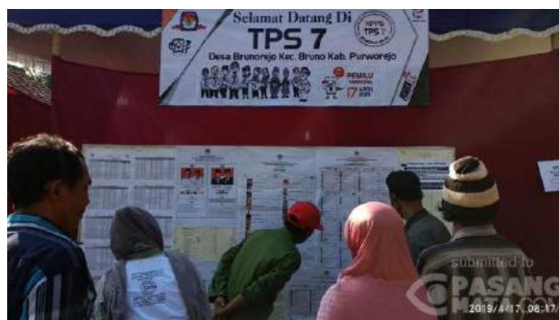
Image VI : “ Bingung Nyoblos Siapa? Coba Lakukan Seperti Warga Brunorejo”

when the elements in the photo can be clearly depicted. What is happening, where, who, when, and how the process happened or even the elements why that event happened can be represented in 1 photo. This can be seen from the photos below: