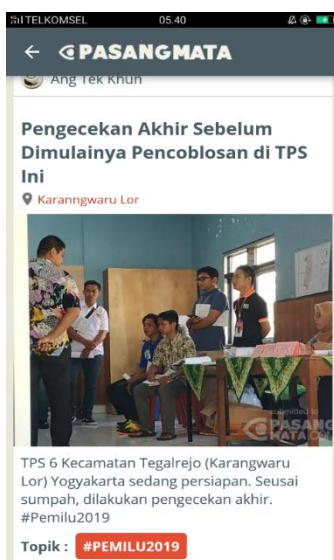
Image 1 : "Pengecekan Akhir Sebelum Dimulainya Pencoblosan di TPS ini"

Judging from the value of journalism, the power of photojournalism is indeed the visual side but the informative aspect is no less important. As many as 11 photos of the "Mata-Mata" of the PasangMata.com did not meet the informative aspect. The completeness of the informative aspects of a journalistic photo is mainly on the aspects of who and what and other elements can be conveyed in a caption (photo caption). Some photos of the "Mata-Mata" in PasangMata.com are still unable to show in detail and complete information that needs to be known from an event. For example photos with the title "Pengecekan Akhir Sebelum Dimulainya Pencoblosan di TPS ini". From the photos it can be seen the unclearness on who did the final check whether it is the KPSS Officer or the witness or from which party. And in the Caption also not mentioned the element of "Who" who carried out the final checking activities.