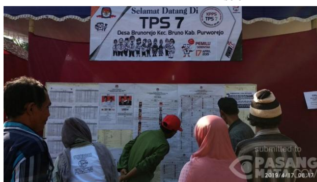
Image VI : “ Bingung Nyoblos Siapa? Coba Lakukan Seperti Warga Brunorejo”

when the elements in the photo can be clearly depicted. What is happening, where, who, when, and how the process happened or even the elements why that event happened can be represented in 1 photo. This can be seen from the photos below: