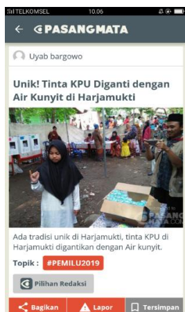
Image II : “ Unik! Tinta KPU Diganti dengan Air Kunyit di Harjamukti”