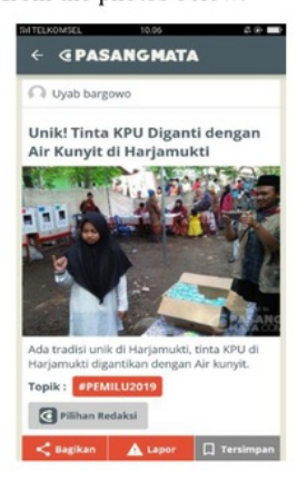
Image II: "Unik! Tinta KPU Diganti dengan Air Kunyit di Harjamukti"

As many as 18 of "Mata-Mata" photos on PasangMata.com have elements of human interest. The human interest aspect of a journalistic work as a news value refers to things that are interesting, sympathetic or can be used to show the "other" side of an event. In the context of the 2019 election the human interest aspect arises in terms of interesting things like photographs showing the differences in ink used in this election in one area in Harjamukti from Uyab Bargowo's submissions. Or the side that invites sympathy when one photo shows a person with disabilities who is also elderly still does not miss the opportunity to use her rights in participating in the 2019 election. This can be seen from the photos below: