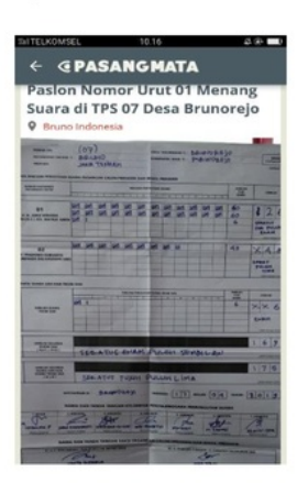
Image IV: "Paslon Nomor Urut 01 Menang Suara Di TPS 07 Desa Brunorejo

Based on the above table, it can be concluded that the voting process becomes the most dominant photo content in terms of the technical aspects of taking any photography. This is not something surprising considering the "Mata-Mata" took more moments from the voting process. But some other interesting aspects that can be seen include in terms of the format of the image field, the whole photo showing the results of calculations using the portrait field format. Somewhat different from the theoretical explanation which mentions portrait emphasizes the portrayal of the character characteristics of objects generally human. However, related to the election results, the photos in the form of vote counts written on paper were displayed in portrait form. In addition, the appearance of photos from the vote count also shows the factual aspects that occurred at the polling station. That who outperforms whom can be seen clearly while preventing fraud. This can be observed from the photos below: