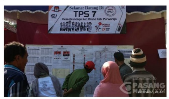
Image VI: "Bingung Nyoblos Siapa? Coba Lakukan Seperti Warga Brunorejo"

Photos with informative journalistic values with long shot framing and symmetrical composition of \frac{1}{2} fields and landscape field format are safe photos to describe an event. The 5 W 1 H news value elements can be clearly represented when the elements in the photo can be clearly depicted. What is happening, where, who, when, and how the process happened or even the elements why that event happened can be represented in 1 photo. This can be seen from the photos below: