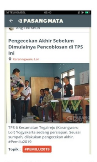
Image I: "Pengecekan Akhir Sebelum Dimulainya Pencoblosan di TPS ini"

PasangMata.com are still unable to show in detail and complete information that needs to be known from an event. For example photos with the title "Pengecekan Akhir Sebelum Dimulainya Pencoblosan di TPS ini". From the photos it can be seen the unclearness on who did the final check whether it is the KPPS Officer or the witness or from which party. And in the Caption also not mentioned the element of "Who" who carried out the final checking activities.