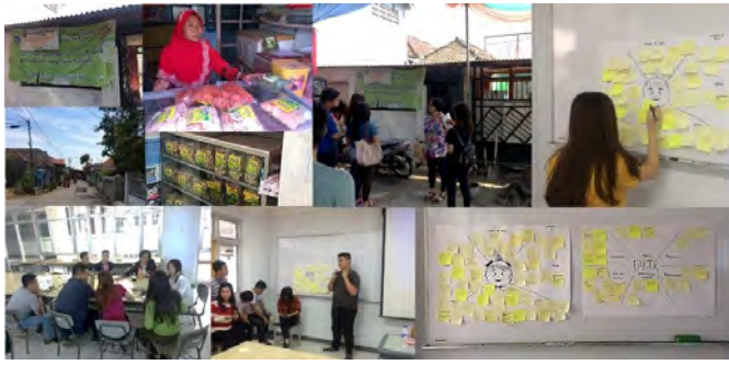
Fig. 1. Ideation Process with brainstorming method.

At the Ideation stage students brainstorm spontaneously at the beginning. Existing ideas were presented in groups, accompanied by spontaneous sketches. Students develop and sketch out design ideas individually and then discuss their ideas in groups. Variations in brainstorming methods were also carried out, which allowed accepting input from groups at different times to bring out better ideas [9]. Students were given the opportunity to develop their ideas individually in different places, and then return to the group to discuss ideas. Five people in a small groups perform individual brainstorms within two hours, then each sketch paper was rotated to other group members to acquire their inputs to the design. This model of criticism gives all members the opportunity to provide input according to their own unique respective concepts and views [10]. This variation made the group's brainstorming process alive and the students frequently came up with fresh ideas (Fig. 2). At the second ideation stage, in the development of design ideas, the groups were divided into two small groups. Students with similar design solutions were grouped into one to brainstorm again the design development. This process is known as one-step filler material, where in practice this effort will minimize differences of opinion so that the same design conclusions can be reached [11].