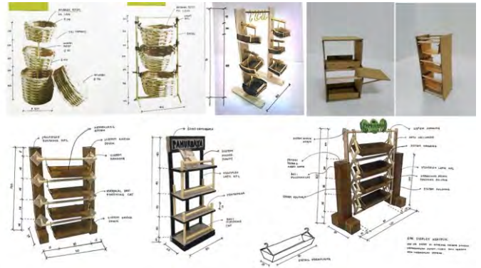
Fig. 3. Ideation development with the Prototyping method.

design can be visually distinguished. The planned assembling and dissembling system could also be more seriously considered through Prototyping. At this stage, each individual presented his idea to members of the small group and obtained input from other group members. The design results, as seen in Fig. 3, consisted of two main materials namely metal and processed wood.