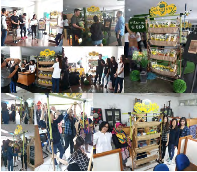
Fig. 5. Test process and product delivery to the Kampung Krupuk community.

branding promotion. Racks were made of metal pipes, iron folding, and goni fabric. The height of the shelf can be adjusted according to the needs and the display rack can vary in number as needed. And most importantly, the results of the design as the answer to the problem are: the design can be summarized into parts that can be transported using a motorcycle. This problem is the most important point as a result of group brand monitoring to determine the main problems facing the community. Most importantly, the results of the design as the answer to the problems is: the product can be disassembled into parts that can be transported using a motorcycle (Fig. 5).