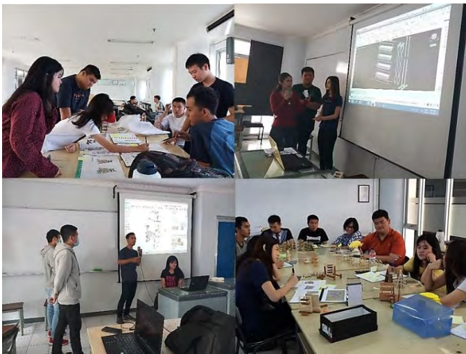
Fig. 2. Ideation Process with brainstorming method.

At the Ideation stage students brainstorm spontaneously at the beginning. Existing ideas were presented in groups, accompanied by spontaneous sketches. Students develop and sketch out design ideas individually and then discuss their ideas in groups. Variations in brainstorming methods were also carried out, which allowed accepting input from groups at different times to bring out better ideas [9]. Students were given the opportunity to develop their ideas individually in different places, and then return to the group to discuss ideas. Five people in a small groups perform individual brainstorms within two hours, then each sketch paper was rotated to other group members to acquire their inputs to the design. This model of criticism gives all members the opportunity to provide input according to their own unique respective concepts and views [10]. This variation made the group's brainstorming process alive and the students frequently came up with fresh ideas (Fig. 2). At the second ideation stage, in the development of design ideas, the groups were divided into two small groups. Students with similar design solutions were grouped into one to brainstorm again the design development. This process is known as one-step filler material, where in practice this effort will minimize differences of opinion so that the same design conclusions can be reached [11].