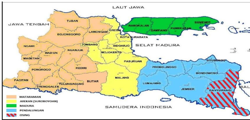
Figure 1 : Local Communiy Group Map

The power of social media to support Gus Ipul – Puti Maharani’s electability could generally only be obtained from potential voters in urban areas. This means that, empirically, Gus Ipul and Puti Maharani would need to work extra hard to attract potential voters in non-urban areas. In terms of political investment, Gus Ipul had already had the opportunity to promote himself to the public as he had served as the Vice Governor for two consecutive periods (2009-2014 and 2014-2019). Still, as politics is highly dynamic, everything would need to be utilized maximally.