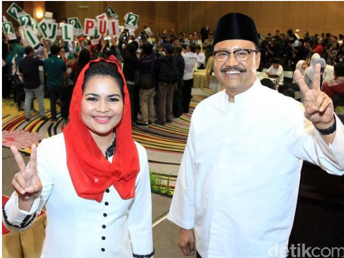
Example of door-to-door campaign