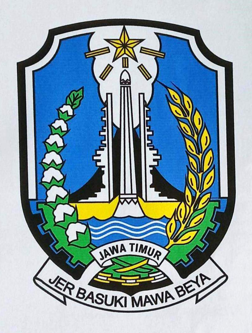
EAST JAVA PROVINCIAL GOVERNMENT