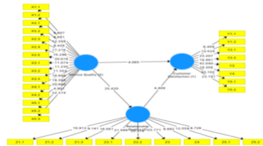
Figure 2. Inner Model

Hypothesis testing is done by observing the t-statistic and the influence of coefficient (original sample estimate). The hypothesis of the research is accepted if t-statistic > 1.96. The following figure is the result of the influence of coefficient and t-statistic: