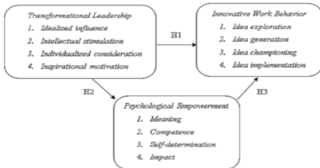
Figure 1. Research Framework

Figure 1 shows the conceptual framework for this research that explains the relationship among variables.