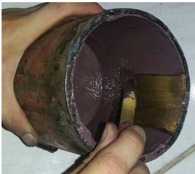
Fig. 1. Steel crucible coating.

To prevent iron diffusion to the aluminium melt, the inner wall of the steel crucible used in this work was coated prior to melting process (Figure 1). Iron diffusion to the aluminium should be prevented since iron deteriorates mechanical properties of aluminium alloys [3].